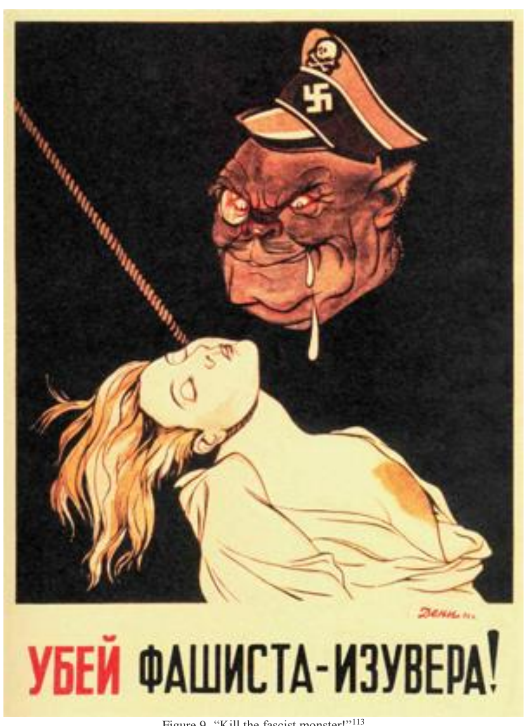
Figure 9- "Kill the fascist monster!" 113