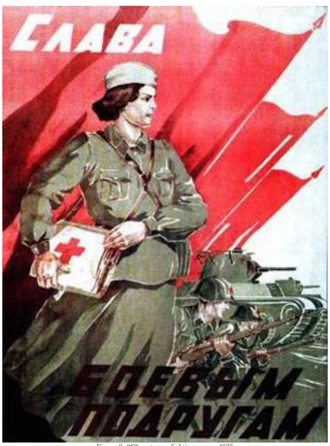
Figure 8- "Glory to our fighting women!" 101