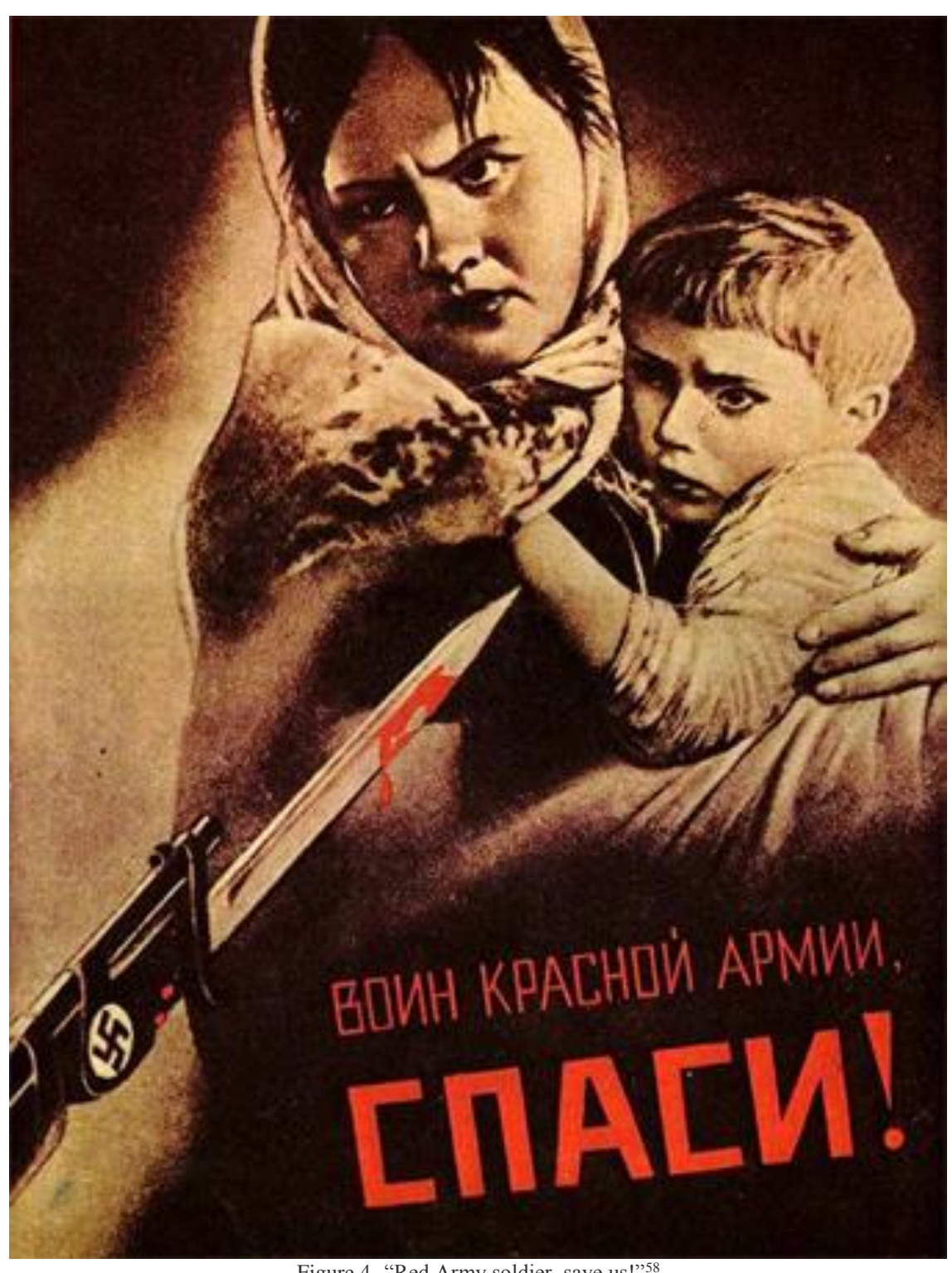
Figure 4- "Red Army soldier, save us!"58