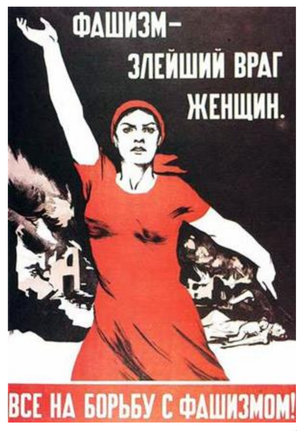
Figure 2- "Fascism is the worst women's enemy. All on the fight with fascism!" <sup>10</sup>