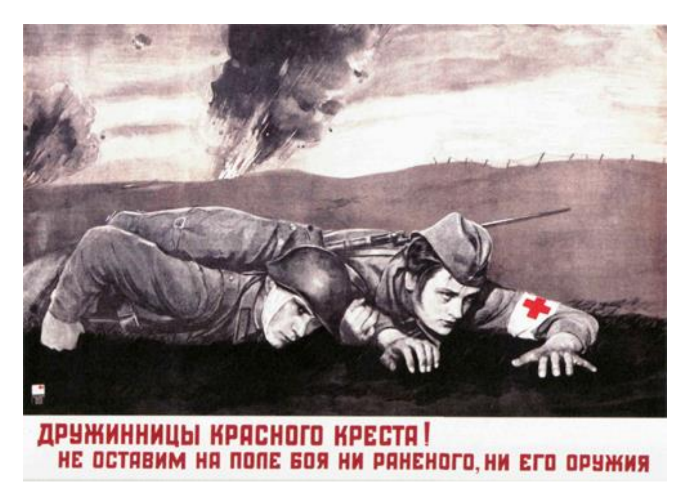
Figure 3- "Red Cross nurses, don't leave on the battlefield no wounded, nor his weapon." 30