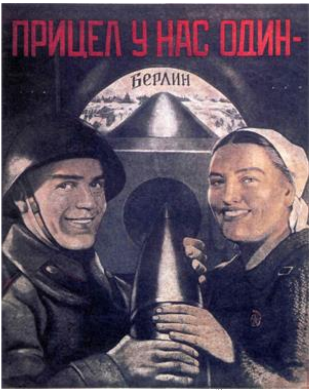
Figure 7-"Berlin is our common target!" 100

prodigious patriotic propaganda posters that urgently called for "increased production or patriotic appeals to help defeat Hitler's inhuman and savage army." <sup>99</sup>