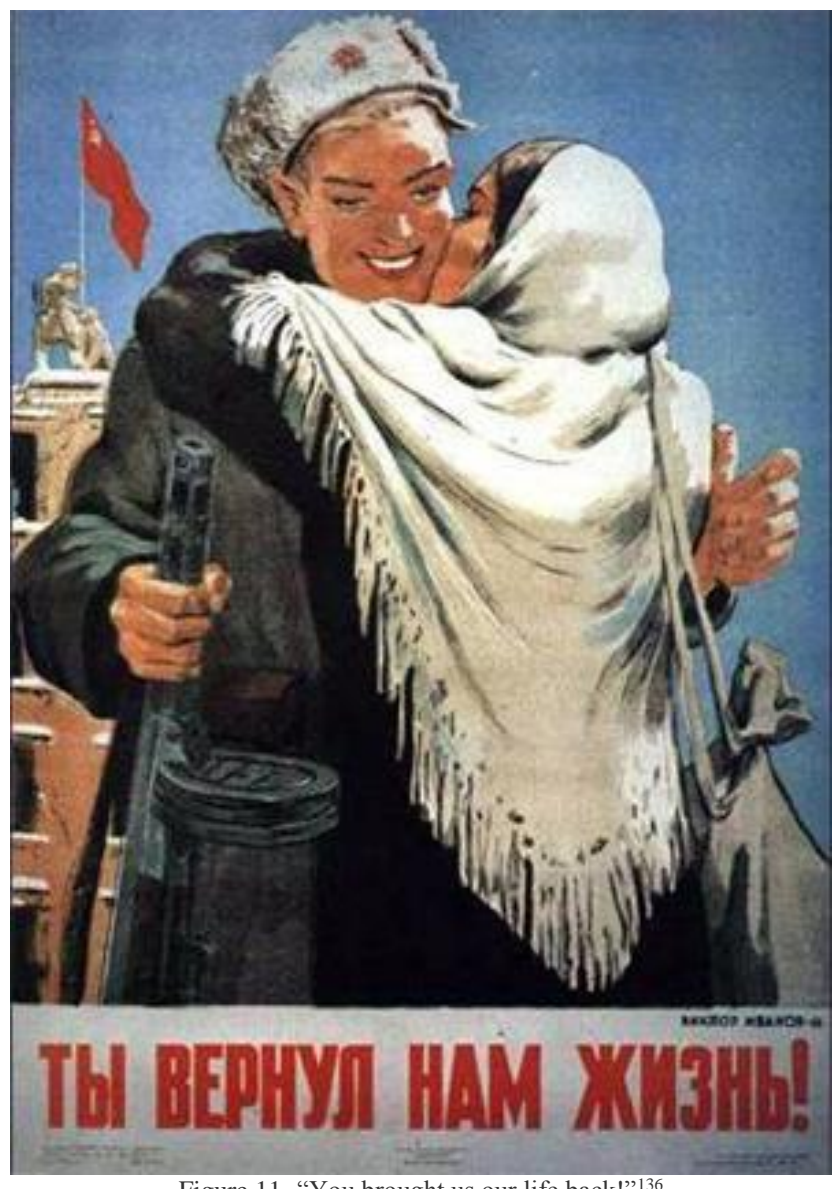
Figure 11- "You brought us our life back!" 136