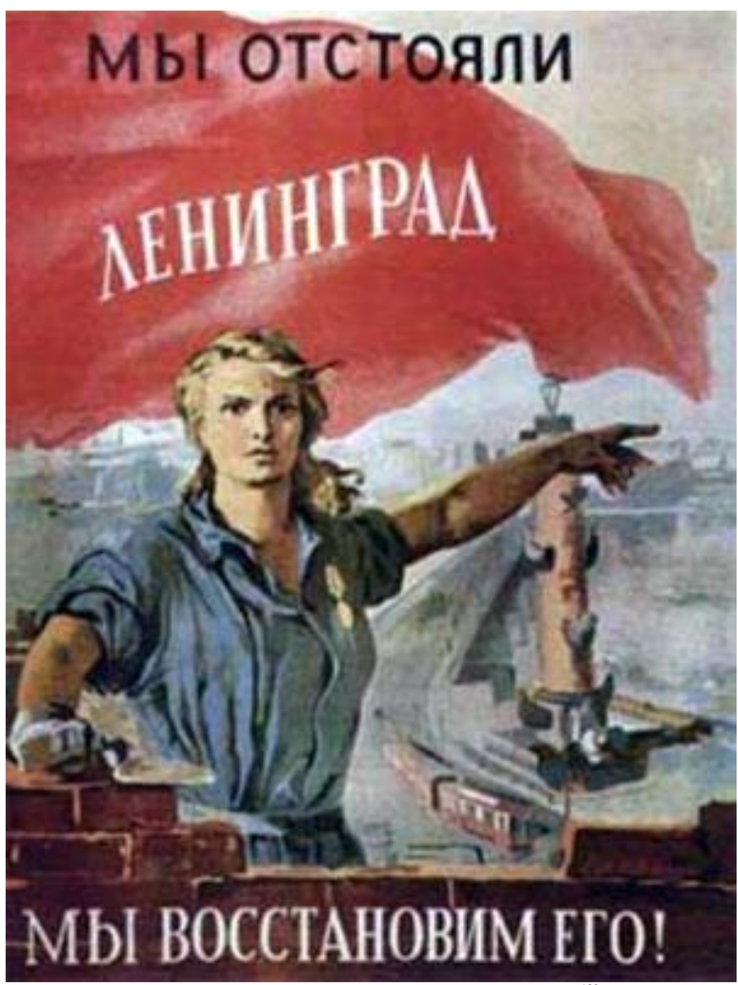
Figure 12- "We defended Leningrad, now let's rebuild it!" 138