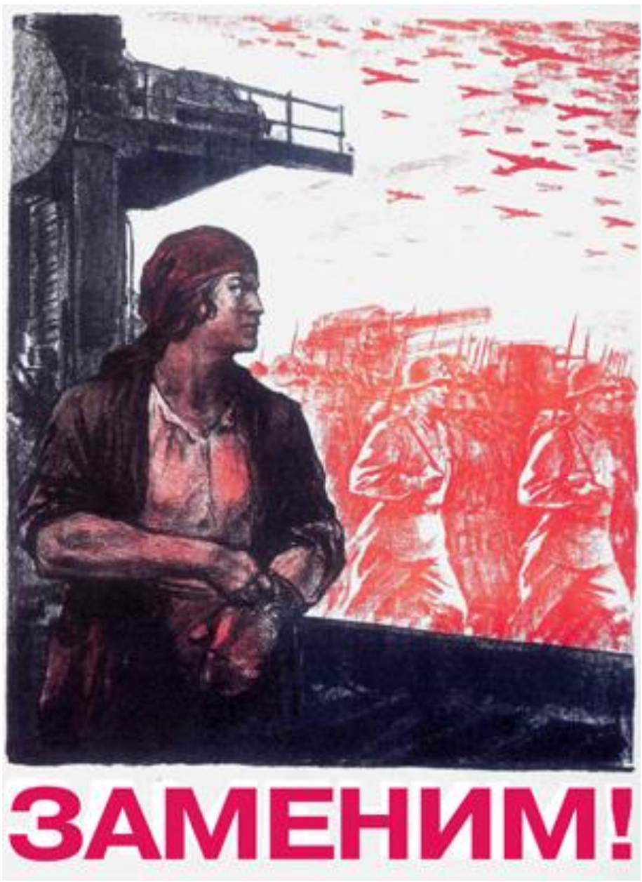
Figure 1- "We will take your place."4

enormous losses depleted manpower, women transferred to the heavy industry and construction sectors. By 1942, sixty percent of defense industry workers were women.<sup>3</sup>