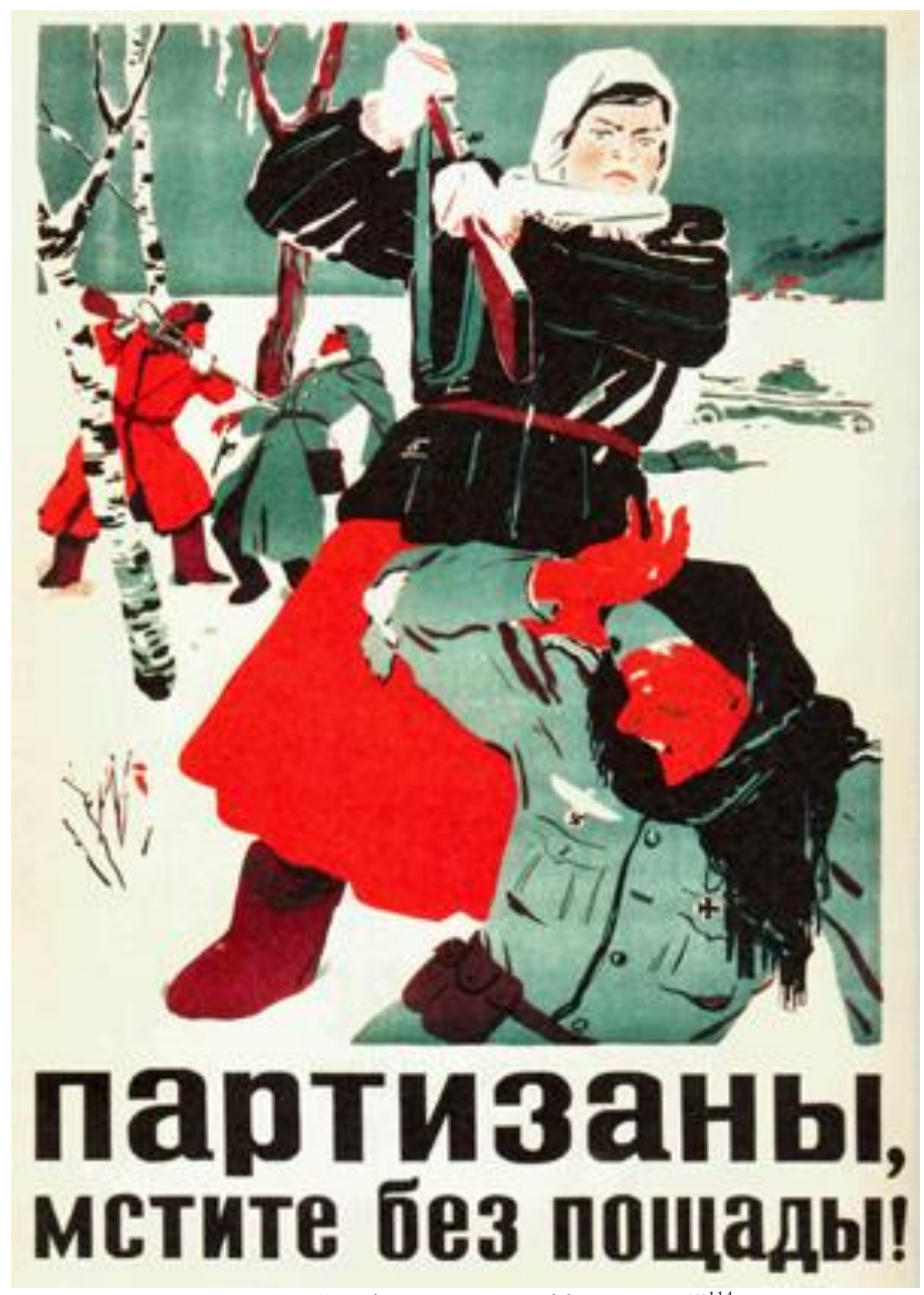
Figure 10- "Partisans, revenge without mercy!" 114