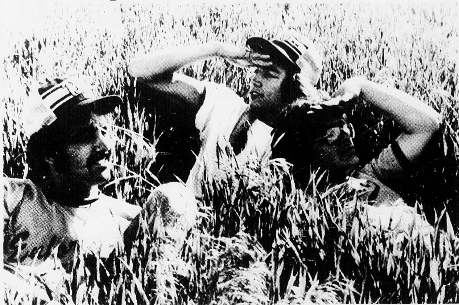
Three Eagle Wheatfind team members keep a sharp look-out for enemy combines during an early season work-out in nearby Cheney wheatfields.