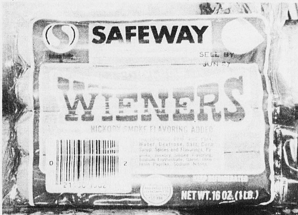
The last photograph taken of the A.S.S. Legislators in a group before their mysterious disappearance this week. If anyone has seen the legislators, don't let anyone know.

If anyone has information on students who are known drinkers of that particular brand, please contact Campus Hazards immediately. All identities will be protected.