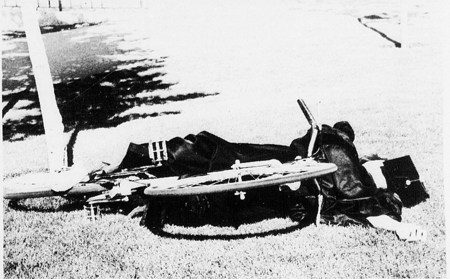
Many students have found the activities planned for graduation June 10 overcoming. The student above collapsed after a strenuous practice for one of the planned events, bicycle obstacle course racing.

No one was available at the time to comment on this.