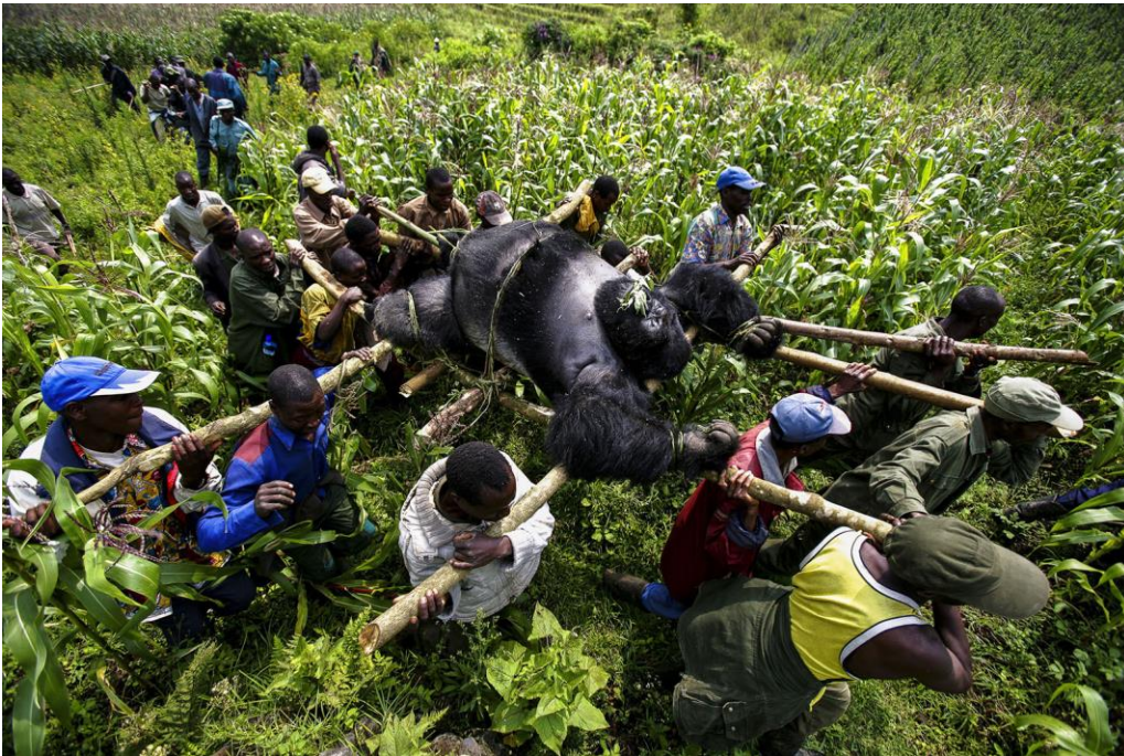
Figure 2 - https://virunga.org/projects/gorilla-protection/

Virunga National Park also has a unique relationship with the local communities living in and around the park. Since it is not a traditional zoo and was established as a protected area in the wild, there is a much more transparent and close bond between the animals and staff of the park and the people who live in the surrounding areas. After the death of the mountain gorillas in 2007, the community banded together to mourn the loss.