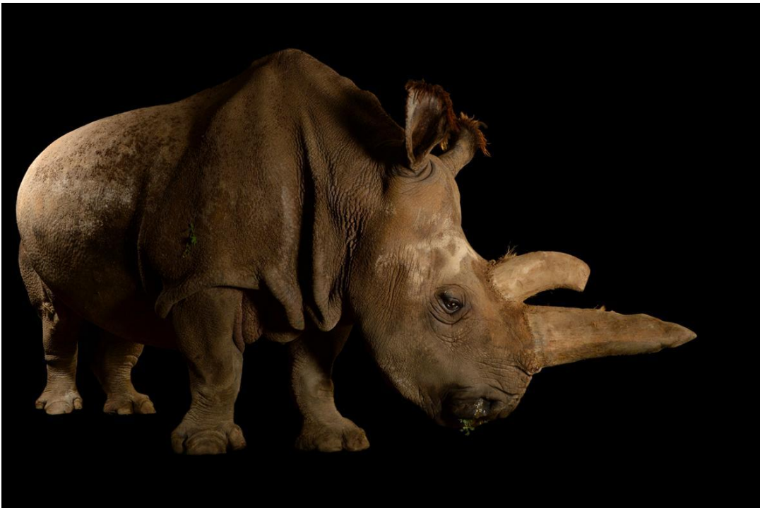
Figure 3 - http://news.nationalgeographic.com/2015/07/150729-rhinos-death-animals-science-endangered-species/

successful breeding programs within institutions with living collections such as the Bronx Zoo. These facilities can be used as models for similar breeding programs around the world, and be a source of education.