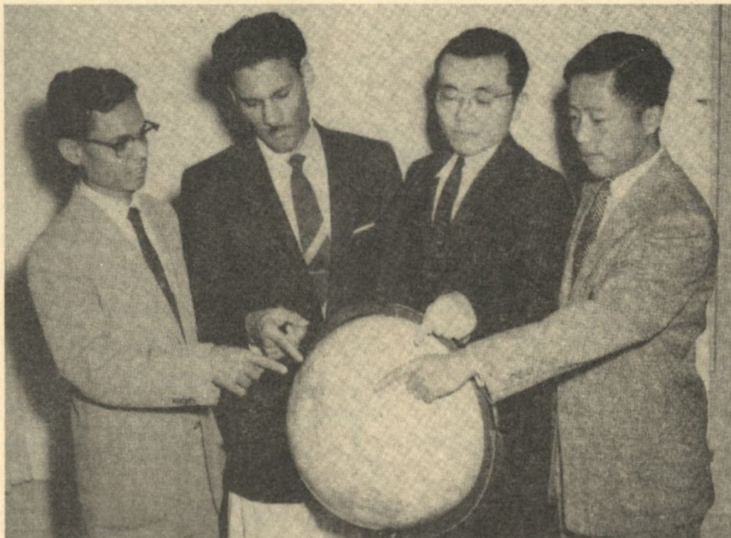
International students (1957) debate where missions would be most strategic.