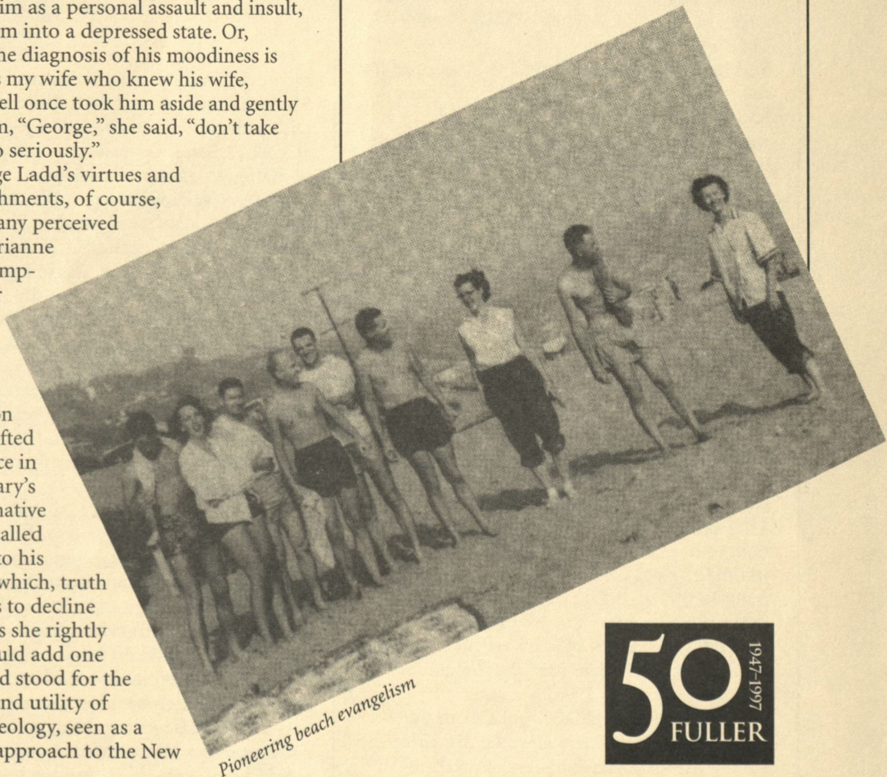
Pioneering beach evangelism