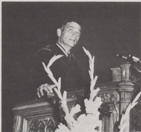
MARK O. HATFIELD

Being here at Fuller Seminary brings back many memories. Among other things, this evening I recall how years ago I used to listen to "The Old Fashioned Revival Hour" with Charles Fuller and his wife on the radio. And I particularly remember how Mrs. Fuller would always read letters sent in from listeners. During the past few weeks I have also been receiving some of the most remarkable, disturbing and memorable mail. So I thought that there would be nothing more appropriate than to begin my comments tonight by reading a few of the letters I have recently received.