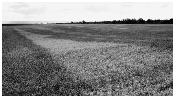
Fig. I – Field damage caused to cereals by Heterodera avenae group in Sicily.

The identification to species level was based on morphology of cysts and their perineal patterns and on morphology of 30 second-stage juveniles per cyst, with special emphasis to total body length, length of the tail (both total length and the length of jaline tail portion) and