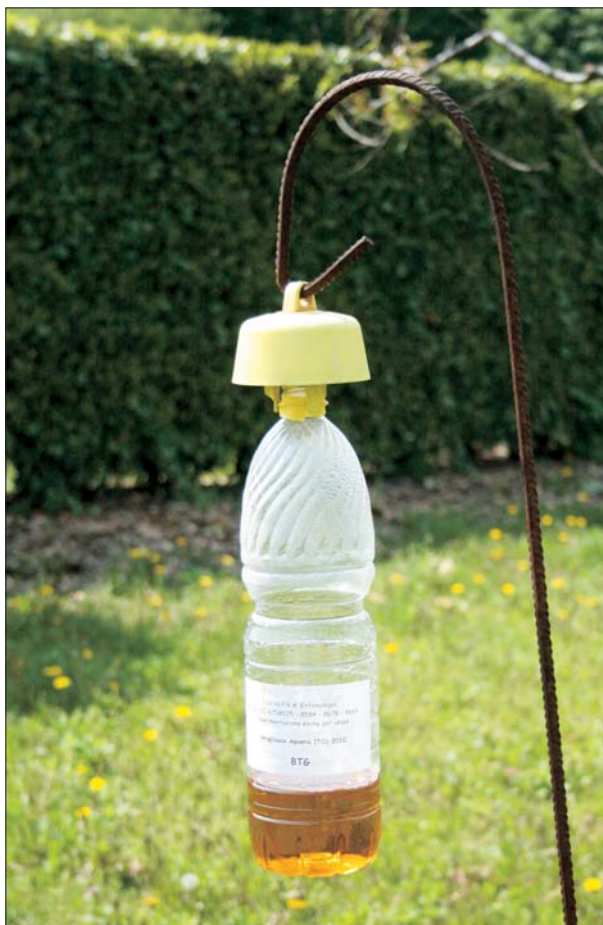
Fig. I – Bait-trap.

For evaluating the change in diversity of social wasp