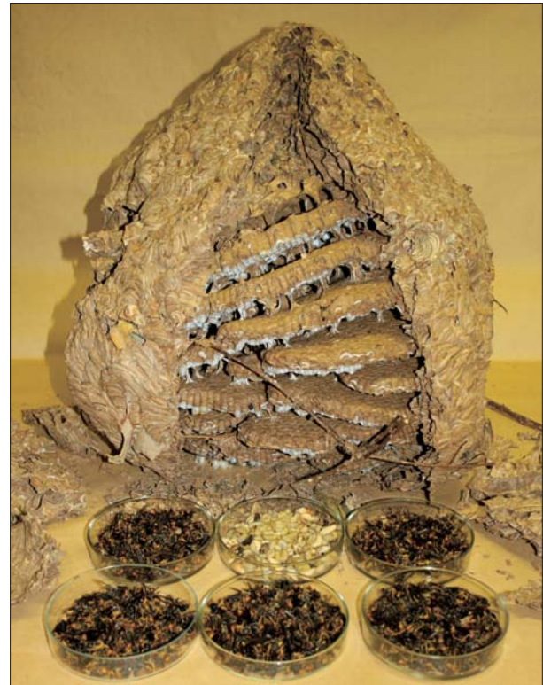
Fig. IV – Developed nest of Vespa velutina nigrithorax collected at Dolceacqua on 14 th November 2013. Diameter 57 cm.

V. v. nigrithorax flight periods observed in Piedmont