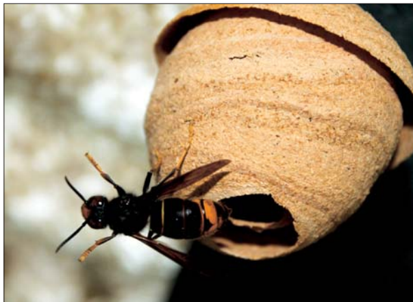
Fig. III – Embryo nest of Vespa velutina nigrithorax collected at Airole on 27 th April 2014. Diameter 44 mm.