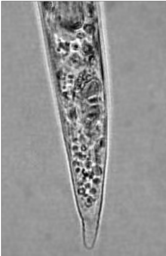
Fig. IV – Short and conical tail of the second juvenile of Meloidogyne artiellia .

melon are poor or non-host for M. artiellia and, therefore, can be included in a crop rotation for controlling the nematode. The rotation should be designed long enough to reduce the soil densities of the nematode below threshold levels and generally one of 2-4 years is satisfactory.