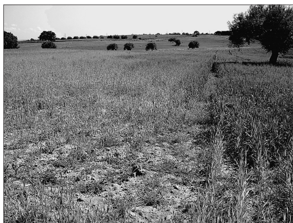
Fig. I – Yellowing and stunting of cereals caused by Meloidogyne artiellia in Sicily.

Identification to species level was made by observing the average morphometric data of 30 second stage juveniles (body length and shape and length of tail) and 30 perineal patterns of females. The observed data were