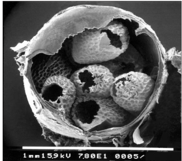
Fig. II – An egg shell of the oak processionary moth ( Thaumetopoea processionea ) containing 7 egg shells of another lepidopteran.

When searching for egg parasitoids of the oak processionary moth, one may encounter the following complicated situation. Females of T. processionea lay their eggs in a single-layered cluster covered by scales during late summer-early winter (BIN & TIBERI, 1983). These eggs overwinter until the bud burst of the oak tree, when caterpillars emerge from the eggs. The egg shells of T. processionea may remain for 1-3 years on branches and can be used by other insects, particularly by other lepidopterans from up to five different families. Females of these other lepidopteran species lay isolated or small groups of eggs in the empty egg shells. We found that females of the winter moth ( Operophtera brumata L.) most commonly used the old egg shells of the oak processionary moth to lay their eggs (ROVERSI & BIN, 2000; Fig. II). In 1998, a sample of 350 old T. processionea egg shells was studied and 2% contained winter moth eggs. In 1999, 8% of 569 egg shells contained winter moth eggs. Up to four winter moth eggs could be found in an old egg shell, but the majority of egg shells contained one egg. Only a small percentage of winter moth eggs are laid in old oak processionary moth egg shells, the majority being laid in crevices in the oak bark. Winter moth eggs, whether laid in crevices or in old T. processionea egg shells, are often parasitized by Trichogramma spp. and Telenomus minutus Ratzeburg.