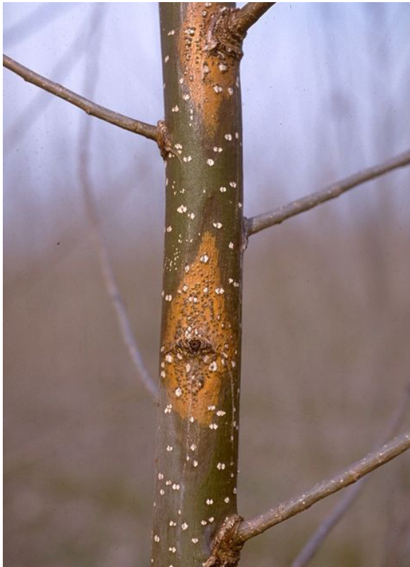
Figure 5 - Poplar twig with necrotic areas corresponding to infections by Cryptodiaporthe populea .

spot” physiologic disorder, already observed throughout the Fifties on ‘I-455’ and ‘I-488’, but not immediately recognised, for a while putatively ascribed to some bacterial agents still to be found. Instead, the “brown spot” disorder was progressively outlined as a paradigmatic syndrome of the times, characterised for climate by increasingly irregular precipitations and extended summer drought, and for agronomy by high inputs of nitrogen fertilisers that pushed to the extreme growth physiologic parameters of some very productive genotypes (Anselmi 1990). By the end of the Eighties, therefore, ‘Luisa Avanzo’, and the related expectations of poplar cultivators and stakeholders of having a new production standard, faded.