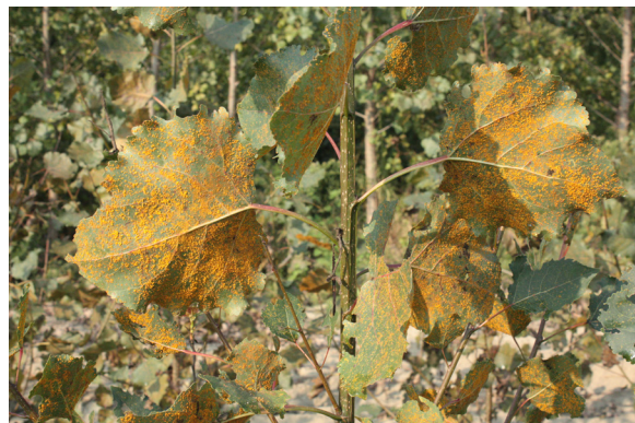
Figure 4 - Poplar leaves with uredinia produced by Melampsora larici-populina .

The E3 race was probably already present in the poplar pathosystem, but it found new hosts with higher susceptibility in the clones meanwhile se-