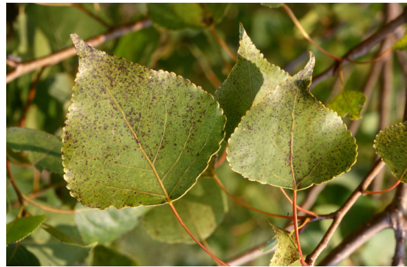
Figure 2 - Poplar leaves infected by Marssonina brunnea .

ing (hence the Italian disease name "bronzatura"). The productive damage in terms of incremental loss is connected with impaired transpiration and with a reduction of photosynthetic efficiency, and subsequently with an early phylloptosis. Marssonina pressure had a selective effect on cultivated Euramerican clones, since the other Jacometti clones and the surviving «Canadians» resulted very susceptible to it and were soon given up, at least in Italy. Instead 'I-214', although susceptible as well, demonstrated a level of tolerance that, with the aid of phytoiatric treatments, preserved it as the «monopolising» clone of Italian classical poplar cultivation. Its plasticity and versatility in several microclimates and soils determined its dominance for the subsequent fifty years, except for some districts like Lomellina where clones of Canadian feature remained (e.g. 'BL Costanzo').