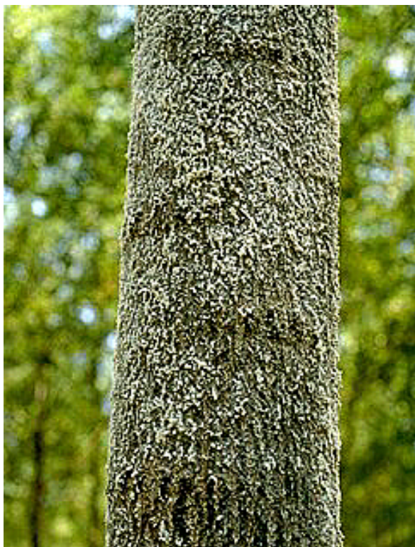
Figure 3 - Poplar trunk infested by woolly aphid, Phloeomyzus passerinii .

The «chemical charge» in poplar cultivation was further incremented by the ever more frequent infestations from the Sixties of the woolly aphid, Phloeomyzus passerinii (Sign.), which involved additional applications on trunks of mixtures of white mineral oil and specific aphicides (Lapietra and Allegro 1981). Its infestations may be very incident owing to the several generations following each other during the vegetative season, visible for their abundant white waxy secretion with woolly appearance on the trunk surface, which may even induce the death of mature trees by progressive necrotising of cortical tissues (Fig. 3). Reported in Italy since 1936, for some decades only occasional, it became progressively recurring soon after the first epidemics of D. brunnea owing to the expansion of the new P. ×canadensis clones previously selected against Venturia , which on the contrary resulted very susceptible to the aphid, 'I-214' included (Table 2), thus pointing out the risk associated with a clon-