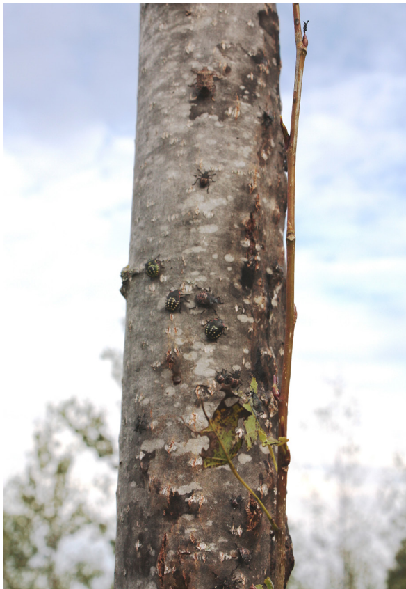
Figure 7 - Poplar trunk infested by Halyomorpha halys .

No new fungal pathogens, on the contrary, have been reported on poplars in the last three decades, apart from Melampsora magnusiana G.H. Wagner