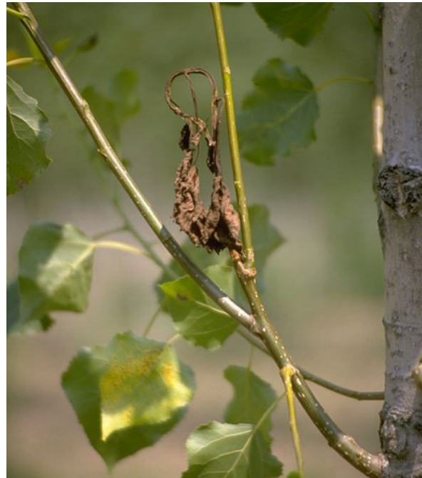
Figure 1 - Poplar shoot infected by Venturia populina with the typical hook shape.

nadian» hybrids, of uncertain genetic composition but the exotic parent of which was conventionally referred to as P. deltoides Bartr. subsp. monilifera (Aiton) Eckenw., characterised by a dense and aggregated crown and thin twigs regularly distributed on the trunk that suggested a wood of good quality to cultivators.