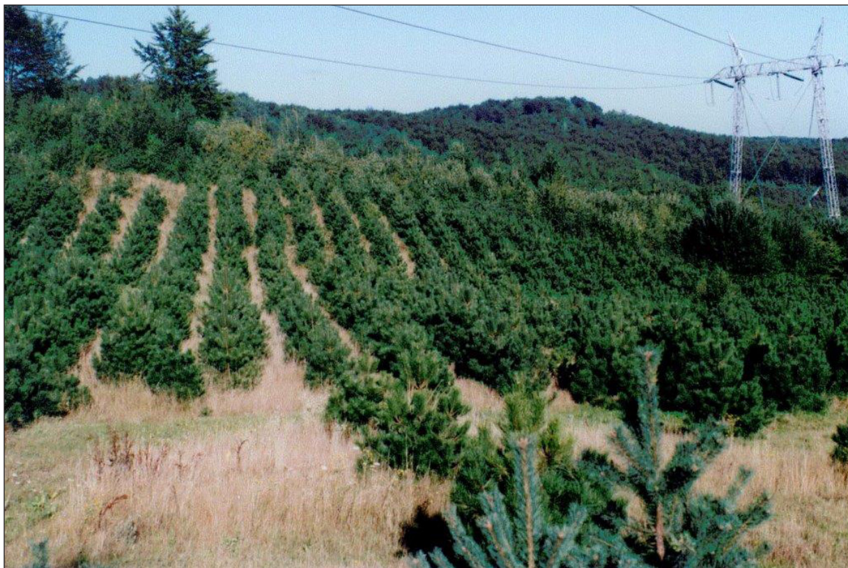
Figure 1 - Generative seed orchard of Austrian pine in Jelova Gora.

last three whorls. The obtained data revealed great variability even in case of slight site changes, as well as great adaptability of the incorporated planting stock. Analysis of correlation confirmed significant positive correlation of almost all elements of growth.