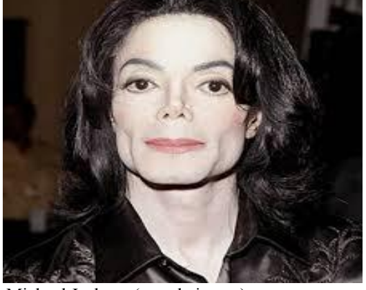
Fig. 3. Michael Jackson