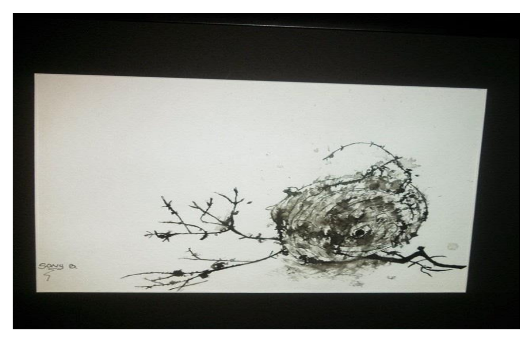
Figure 1. Beehive by Sony De Paula (2008). Black ink and pen.

21 in the intensive care where she slowly faded away as a result of complications during a surgery. She had just turned 71 two weeks prior to her surgery.