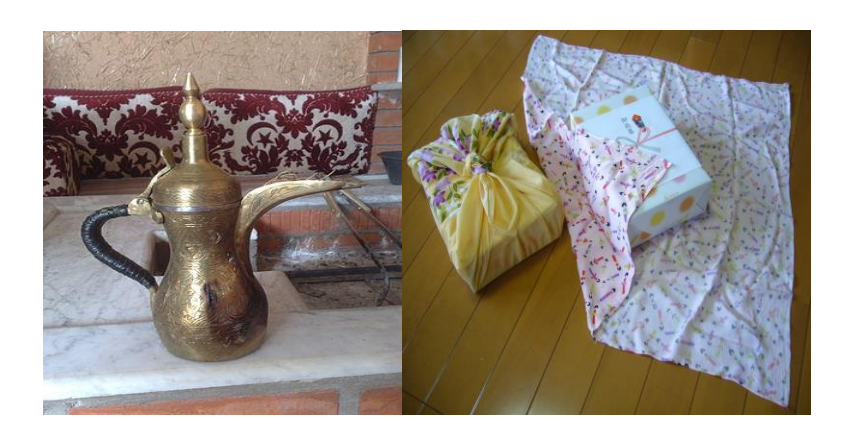
Figure. the dallah (Arabic: دلة) and The Furoshiki(風呂敷