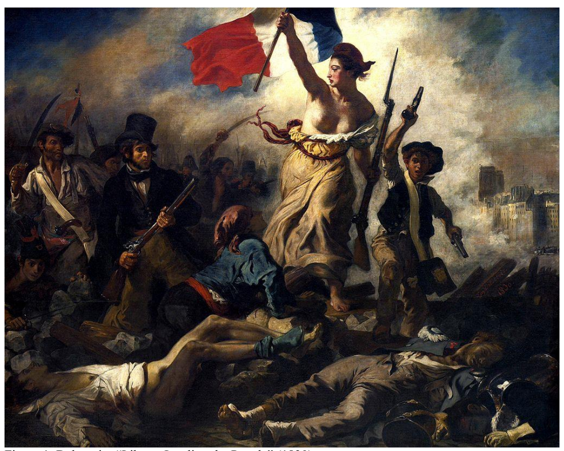
Figure 1. Delacroix: "Liberty Leading the People" (1830)

This picture was painted in 1830s and it described the revolution of fighting against the king who was the symbol of structural inequality, but the meaning of the picture can be used in modern society too. In recent decades, the development of the society that every government were claimed was just using economic inequality to replace the structural inequality, and every young men, in these kind of society have to improve their own power by sacrificing their hobbies, time even and dreams. This picture just mentioned me about how merciless the society is and the only way that we can gain our liberty in this society is improving our power by sacrificing our time, energetic and dreams.