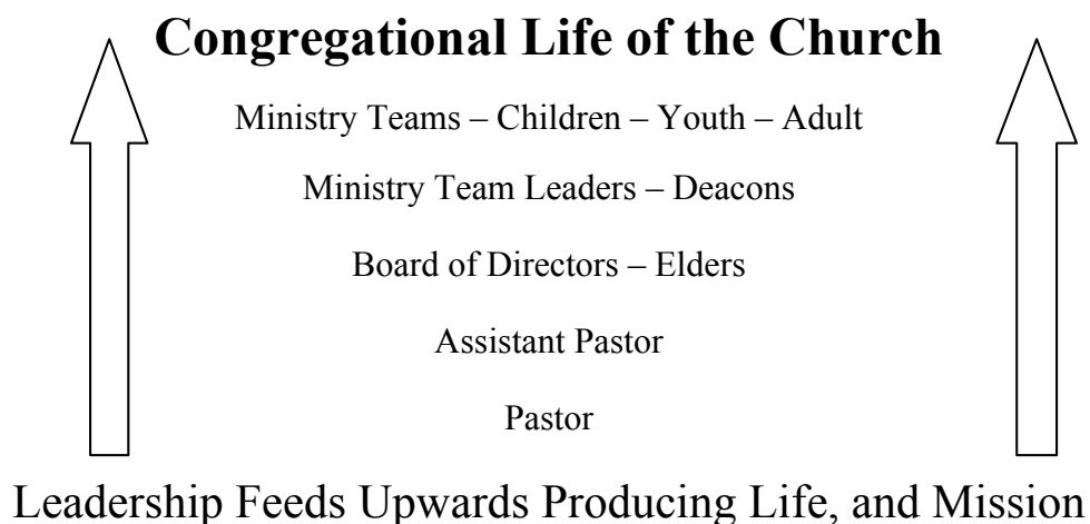
Figure 6.1. Pyramid and reverse pyramid models of leadership