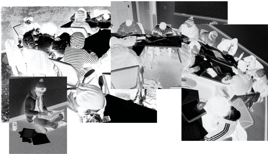
Figure 1. English 101-SL students hard at work writing an in-class essay during the Winter 2014 quarter

This thesis is divided into five chapters. Chapter 2 is a review of literature. Chapter 3 is a presentation of the research methodology. Chapter 4 is the data analysis and reflection. Chapter 5 is the conclusion.