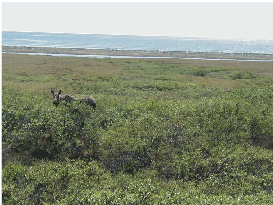
Fig. 2. This female moose is foraging in a stand of Salix pulchra (tealeaf willow) near the shore of Norton Sound; S. pulchra is common throughout the southern Seward Peninsula, Alaska.

further analysis. A split of the minus-2-mm material was ground to pass through a 0.15-mm sieve, using an agate shatter box. This material was subjected to chemical analysis using inductively coupled plasma-mass spectrometry (ICP-MS) following a 4-acid digestion protocol (Crock et al. 1999, Briggs and Meier 2002). A subset of A-, B-, and C-horizon soils was examined by quantitative x-ray diffraction (XRD) for their bulk mineralogical composition (Gough et al. 2008).