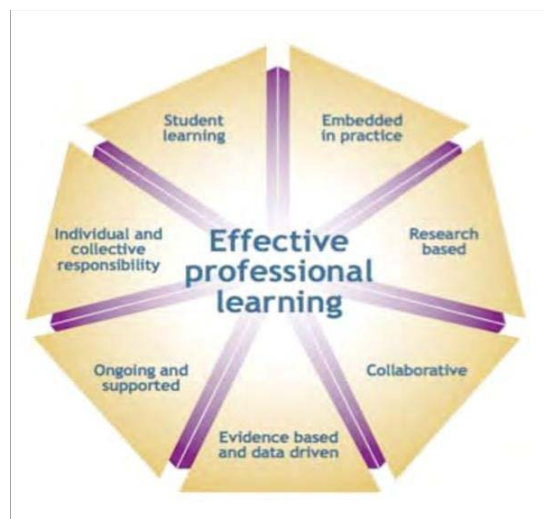
Figure 1. Effective Professional Learning (PEI Department of Education and Early Childhood Development 2013, p. 56)