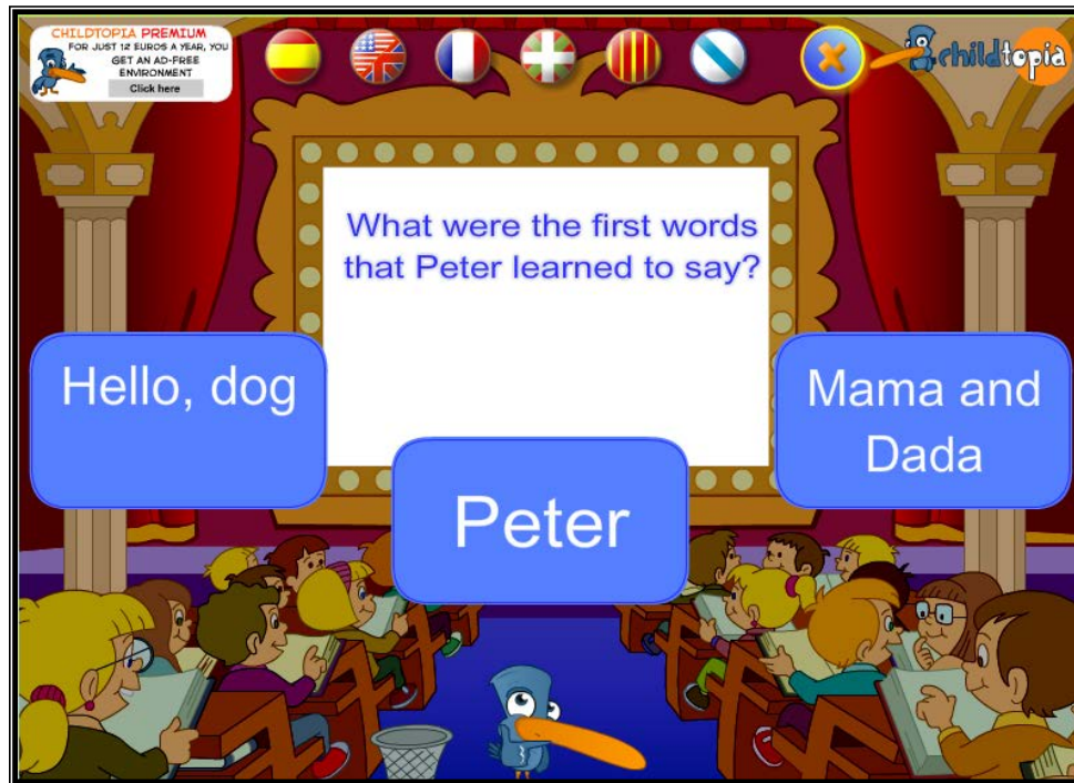
Figure 2: Example of post-reading comprehension question from ChildTopia™

Each story was also accompanied by a set of 10 follow-up comprehension questions that were mainly factual and read aloud using the same female narrator's voice (see Figure 2 for a sample screenshot). Independent readers, however, had the option of turning off the audio narration and read the stories and questions to themselves.