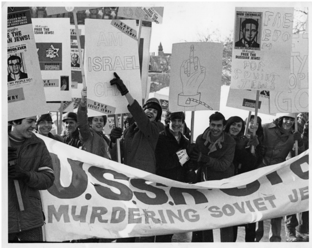
Save Soviet Jewry demonstration, YM-YWHA, Montreal, c. 196-? Fonds 1255, PR010119.

The Six-Day-War brought to the fore a heightened awareness among Montreal Jews of the plight of world Jewry and specifically that of Soviet Jews. Soviet Jews who proclaimed their Jewishness and support for Israel suffered greatly under that regime, and Canada's new identification with Israel extended to people oppressed in its name. The newly formed Committee of Concern for Soviet Jews reached out to Jews around the world for support, and Jewish student groups responded rapidly.