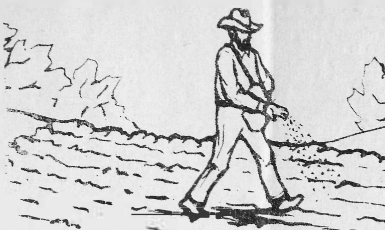
—South Range Ranch, Mansfield, Mo.

I will content myself with a minimum of things conducive to a clean, comfortable and efficient abode. Counter advertising.