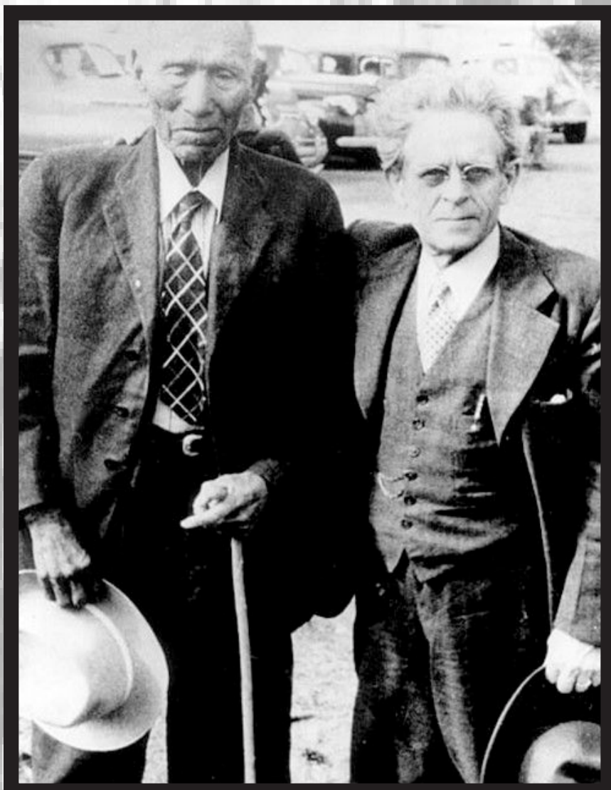
Black Elk and John Neihardt in 1945

This research explores how literal and metaphorical distance placed between humans and their environments has resulted in social and geographical alienation. Studying modern literature reveals this alienation, as well as potential remedies for it.