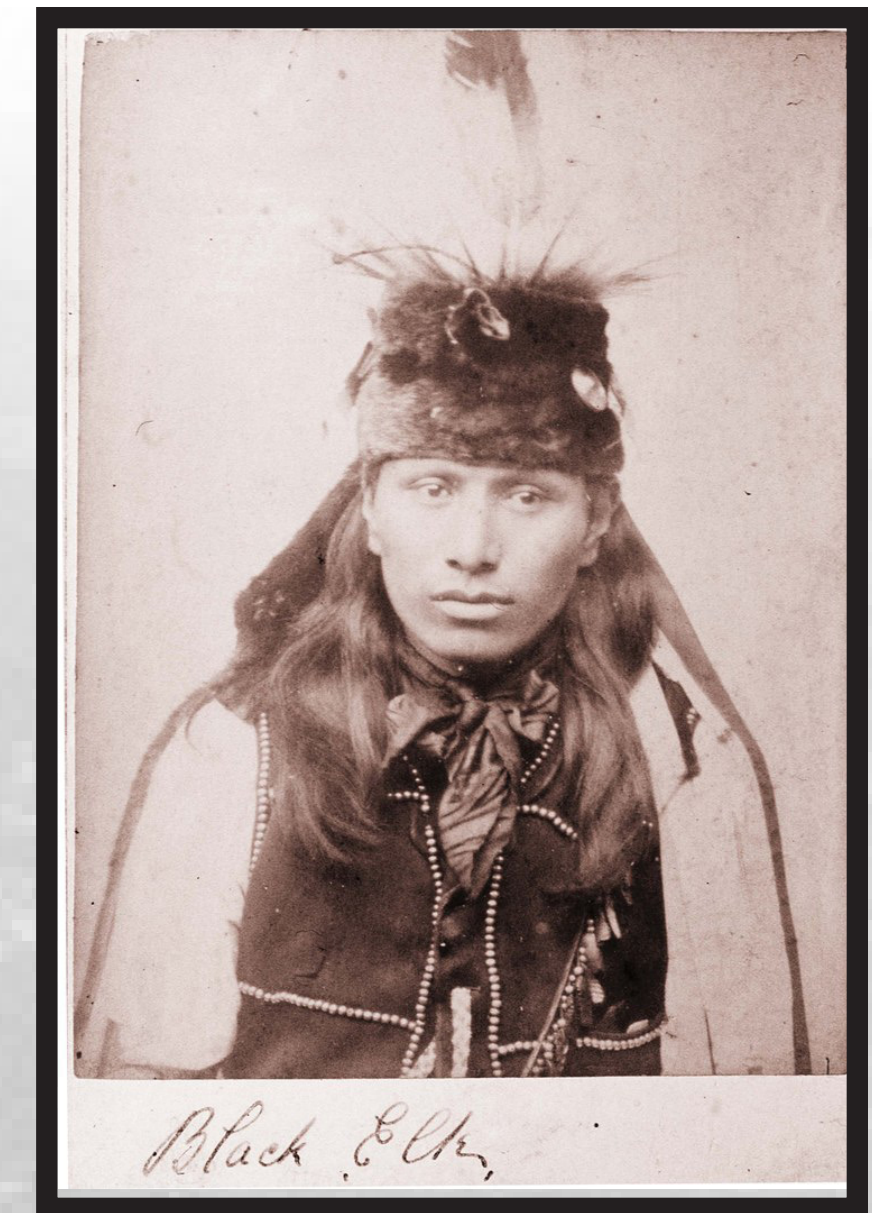
Photo of a young Black Elk

This work can ultimately be applied to innumerable current contexts. Actions taken especially in political spheres should be based upon consideration of both physical and social landscapes. If alienation has resulted from a distance between human populations and their physical environments, the solution is a joining of the two, a pursuit of harmony between them. Like the decision to rename Harney Peak to Black Elk Peak (discussed in the paper), decisions must reflect not only a commitment to social justice, but also a commitment to environmental justice. In the words of Barry Lopez, “The shape of the individual mind is affected by land as it is by genes.”