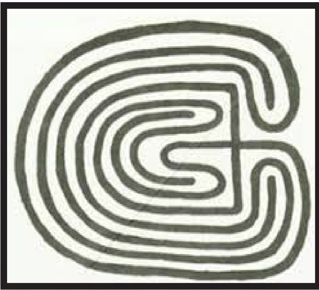
Ancient Native American symbol for emergence