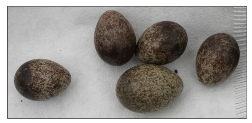
Figure 3. A clutch of Meadow Pipit Anthus pratensis eggs and a Common Cuckoo Cuculus canorus egg. The cuckoo egg shows quite good mimicry with the Meadow Pipit eggs.

The average dates for Meadow Pipits to initiate egg-laying in the period 2004–2014 are provided in Table 2. In the present material, cuckoos laid eggs from 6 to 24 June. In Area I, and for the whole data set, the average egg-laying date of the cuckoo was 14 June (n = 11). In Area II, the cuckoo laid her egg on 10 and 11