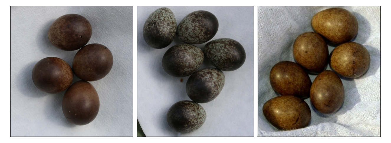
Figure 1. Examples of Meadow Pipit Anthus pratensis egg clutches showing considerable differences between but minor differences within clutches.

Figure 1 shows examples of Meadow Pipit egg clutches. The colour and markings of Meadow Pipit