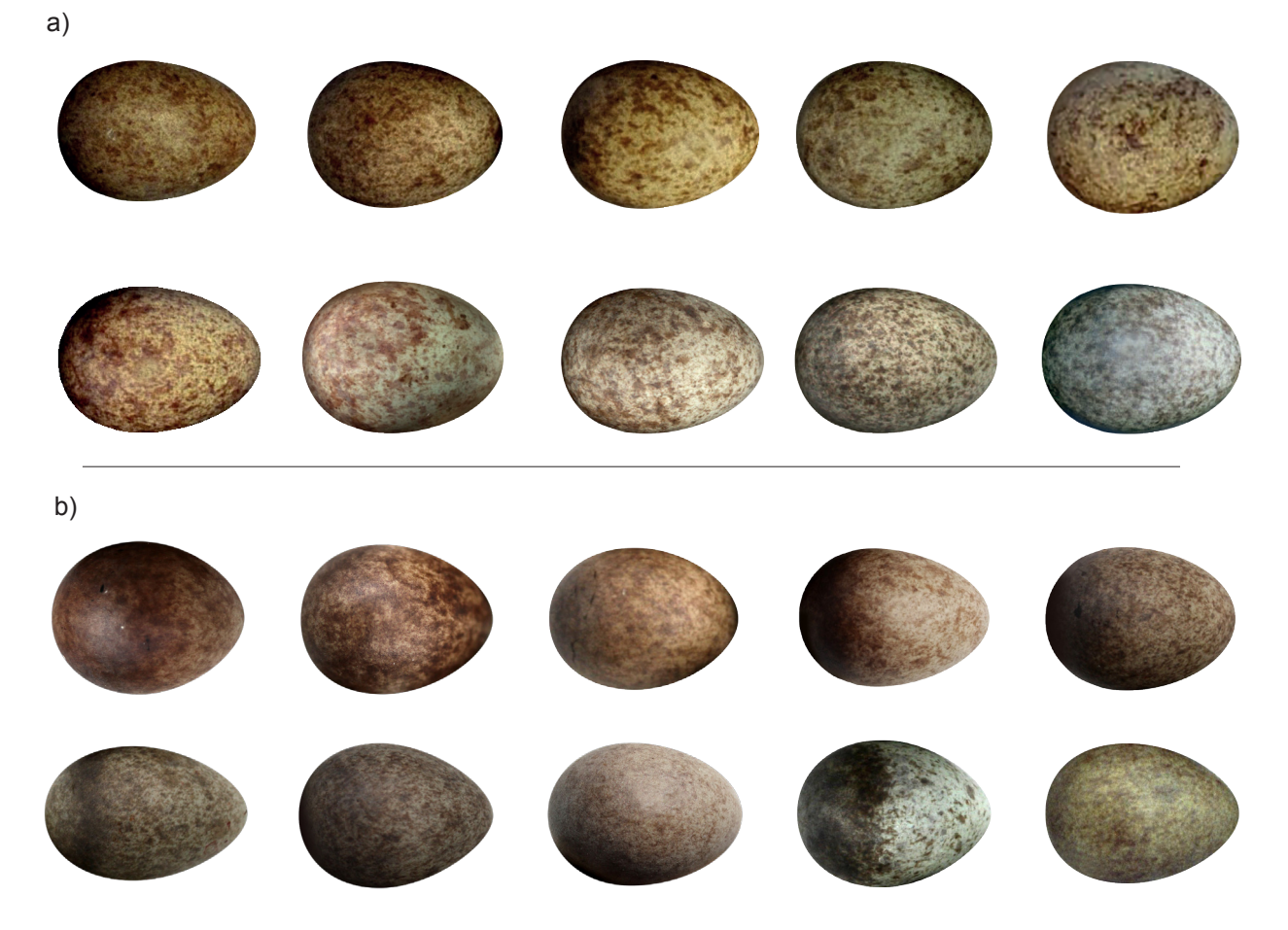
Figure 2. Eggs of Common Cuckoo Cuculus canorus (a) and Meadow Pipit Anthus pratensis (b).

eggs vary between the clutches, whereas the differences between the eggs in the same clutch regularly showed only minor differences. Photos of all the cuckoo eggs recorded and a sample of Meadow Pipit eggs are presented in Figure 2a and Figure 2b, respectively. The overall impression is that the eggs show quite good accordance between cuckoo and Meadow Pipit eggs (see Figure 3 for an example). To the human eye, the