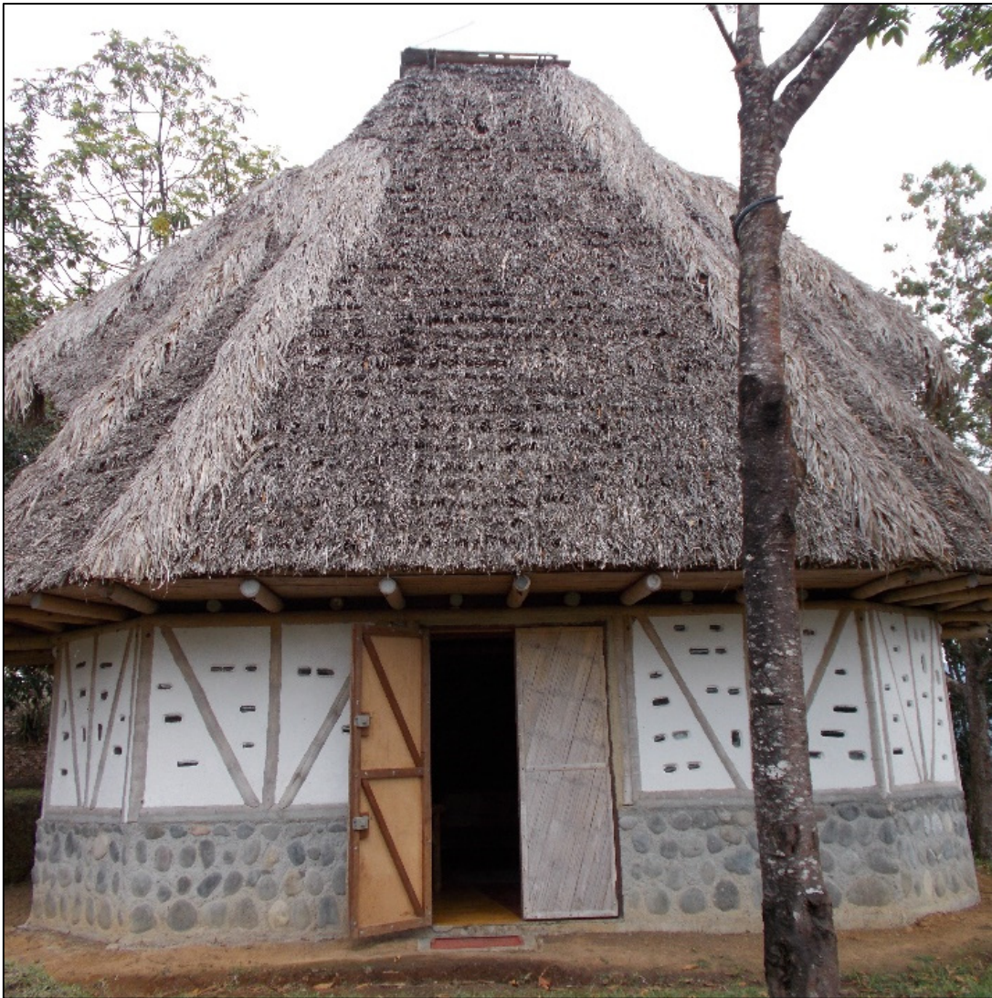
Figure 2: A casa de semillas

An exception: intracommunity loans. The three tactics just described are common to all regions where Red de Semillas works. In one region, however, traditional communities have also implemented the creation of intracommunity loans. These community funds enable community members to develop cropping projects without being forced to use private seeds. Each of the members of the communities that participate in the project contribute a small amount of money every month to a collective saving. When one of them has the opportunity to commercialise seeds/harvest, the savings are made available to that person without predatory lending.