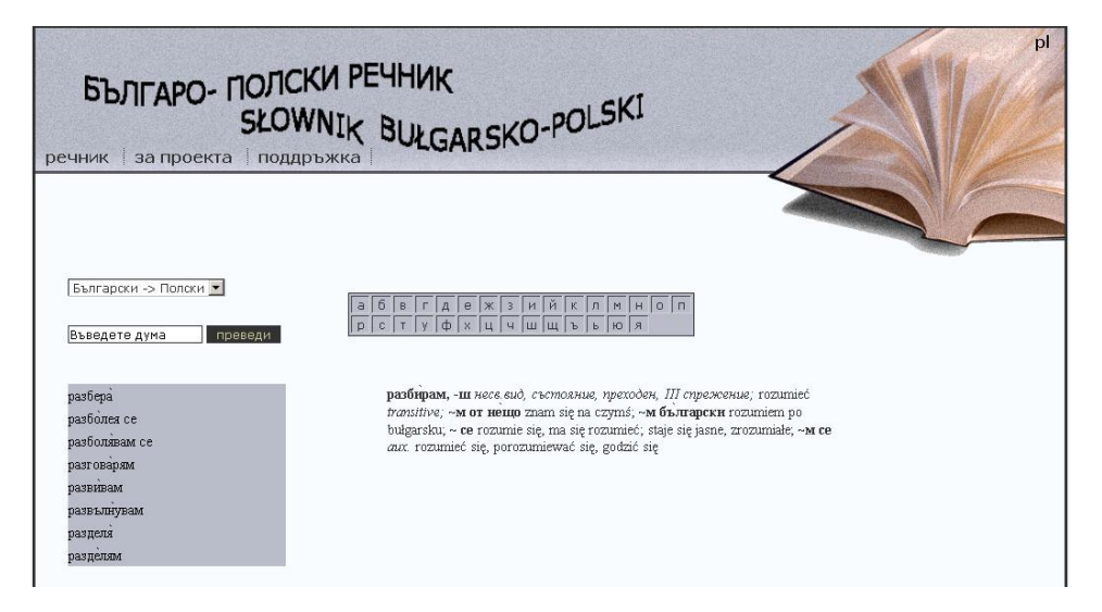
Figure 7. "End"-user module — translation of the Bulgarian word pas6upam

The "end-user" module is "bilingual": the user can choose the input language (Bulgarian or Polish). There is the possibility to search for a translation in both directions: from Bulgarian to Polish and from Polish to Bulgarian. The translation from Bulgarian to Polish will display the whole information that exists in the LDB of the dictionary for the searched word. The translation from Polish to Bulgarian will be composed only using the main senses of the Bulgarian headwords. The "end-user" module provides a Contact form where the casual user can report words currently missing in the dictionary or to warn about errors or gaps in the dictionary entry.