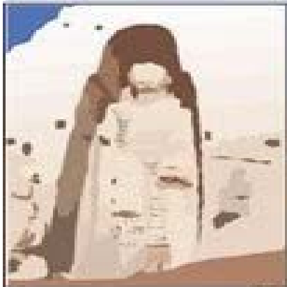
The destroyed 55-m-high-statue

Seven years after Taliban dynamited two 1,500-year-old statues, a French-Afghan team uncovered a new Buddha buried in the earth