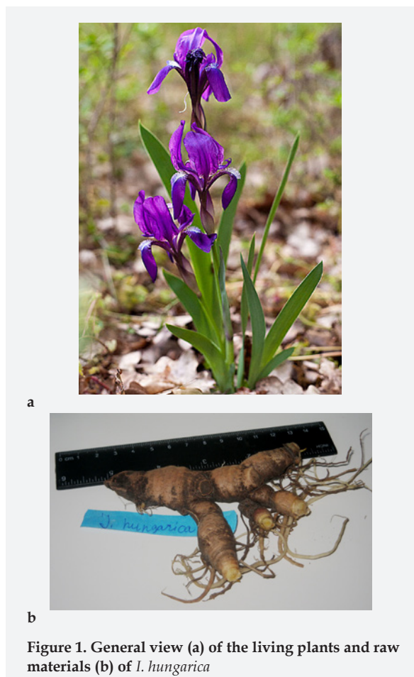
Figure 1. General view (a) of the living plants and raw materials (b) of I. hungarica

The literature data analysis of the chemical composition of the rhizomes of I. hungarica has shown that the plant is almost not studied. Thus, the aim of the work was the isolation and identification of phenolic compounds from the rhizomes of I. hungarica (Figure 1).