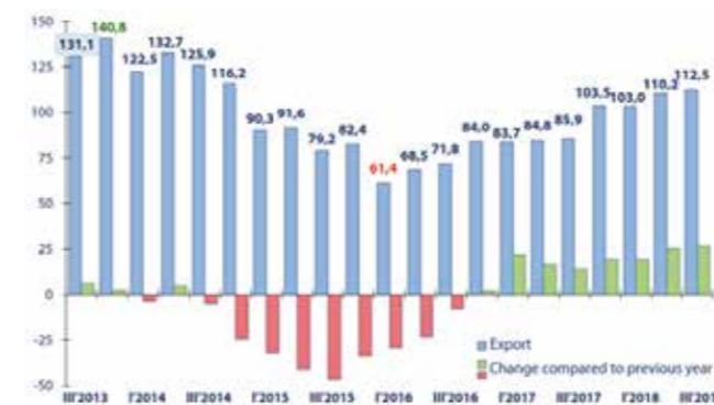
Figure 1. Dynamics of Russian exports, billion dollars 1

The current state of the export activities of the Russian Federation is characterized by a high share of commodity exports, which is about two-thirds of the total exports. Russia's exports for three quarters of 2018, according to the Russian Federal Customs Service, amounted to $325.6 billion (Figure 1), non-energy exports increased to $105.3 billion according to the REC's estimates. The growth of total exports compared to 3 quarters of 2017 was 28% (+71.3 billion dollars), the growth of non-energy exports was 16.5% (+$14.9 billion). Positive dynamics of total exports and for non-energy exports are recorded for the eight hand the ninth quarter in a row. At the same time, the quarterly growth rate of total exports for seven quarters does not fall below 20%. The main contribution to the increase in total exports was made by fuel (77% of cumulative growth) and metals (10%). In non-energy exports the main contributors in growth were metal products (44%), food (23%), chemical products (15%) and wood and paper products (11%).