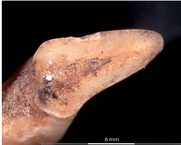
Fig. 6.—Tooth showing traces of sawing.

Most of premolars were intentionally sawed on the crown side to split the tooth into half to make its shape and size similar to incisors (figs. 6 and 7). Similar behavior was recorded on Magdalenian sites in Gönnersdorf and Andernach-Martinsberg, also in the case of arctic fox tooth (Alvarez-Fernández, 2000:fig. 2).