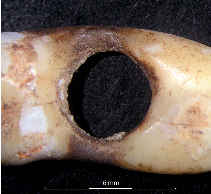
Fig. 9.—Tooth showing discolorations and dulling on the surface and along the edge.

Another issue is how to interpret teeth deposit from Wilczyce. Due to the way it was recorded (see Irish, 2014) the relation of a prenatal child burial and the teeth deposit is not completely convincing as no traces of a grave pit survived. So its interpretation as a grave offering is only hypothetical. Teeth belonged to at least 31 adult individuals that most probably were not hunted by Wilczyce occupants around the site (Nadachowski et al. , 2014; Lasota-Moskalewska, 2014) and the teeth were collected for a longer time. Intensity of traces visible on every specimen point to a long time a dress was used after teeth fastening as well. The way and form they were found – complete and broken pieces clustered in one small spot – suggest that complete teeth were ripped off the cloth before deposition and put together with broken specimens (collected purposely) in a small sack made of organic material, like leather or bark. Accepting the relation of this deposit with a prenatal child burial (grave offering) one may pronounce a symbolic/magical meaning of fox teeth for Magdalenian societies playing distinctive and prestigious role in the burial practices (Vanhaeren and d’Errico, 2005).