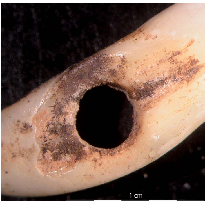
Fig. 3.—Surface of root showing traces of scraping.