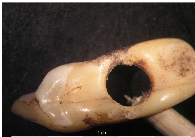
Fig. 4.—Surface of root showing traces of damage.

any initial tooth' surface preparation. In this case small splinters and damages of root surface are visible, usually on ventral parts of the tooth (fig. 4). Perforation was drilled with a flint tool from the upper and lower side of the tooth respectively. Different techniques of making perforations may suggest different persons engaged in its production as well as different time of manufacture. Not all the teeth were found in a complete shape, showing traces of damages that could appear in the course of wearing (fig. 5).