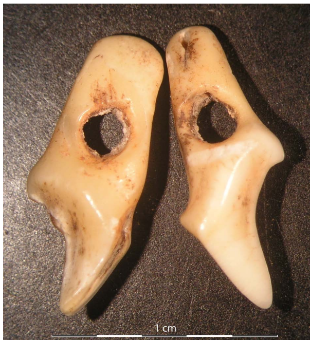
Fig. 7.—Teeth showing traces of sawing.