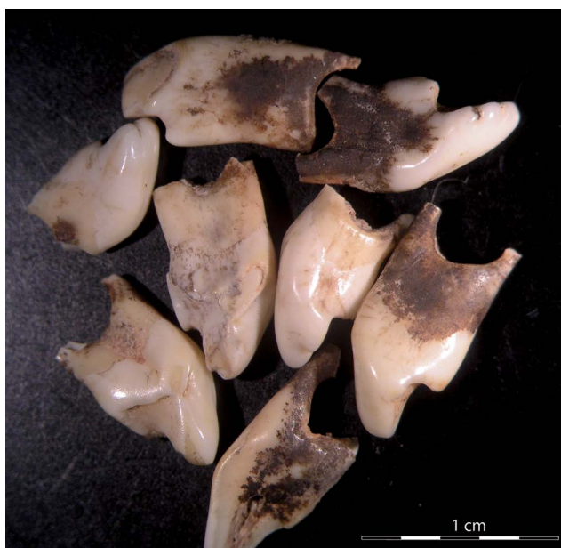
Fig. 5.—Broken perforated teeth.