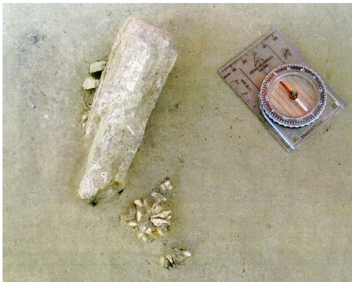
Fig. 2.—Tight concentration of arctic fox tooth beads near a large bone fragment. (after Schild, 2014b:fig. 4.15).