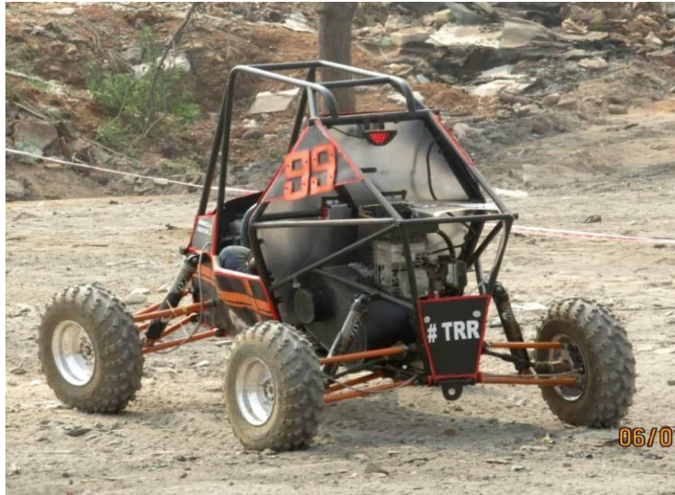
Figure 4: Rear suspension system.