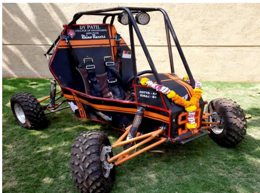
Figure 3: completely designed and manufactured All-Terrain Vehicle.