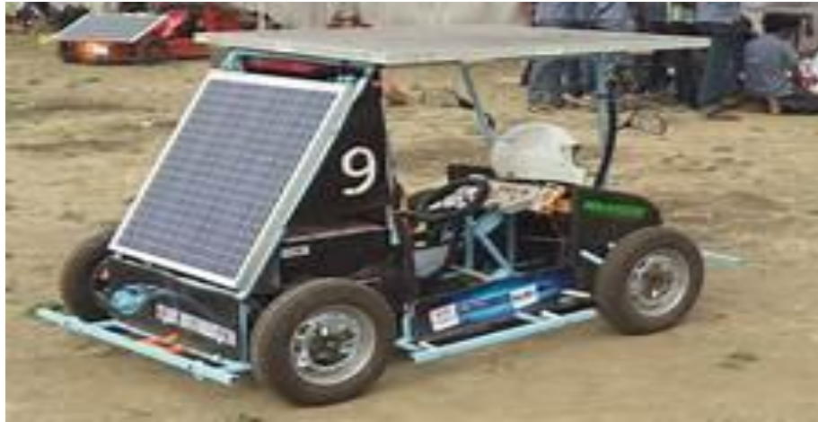
Figure 5: Hardware of project.