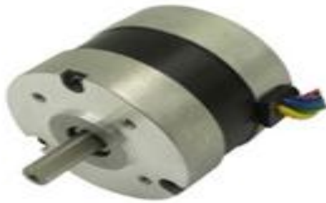
Figure 3: Bldc motor

The operation of a BLDC is based on the force interaction between the permanent magnet and the electromagnet.