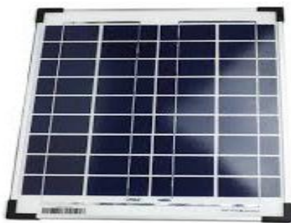
Figure 2: Charging the Batteries through the Charge Controllers

Charge Controller limits the rate at which electric current is added to or drawn from the electric batteries. The prime purpose of using the Charge Controller is to prevent against overcharging and deep discharging of a battery. For the 12V/42Ah battery, 12V/6A solar charge controller is an ideal choice [4]. According to the rating of the battery and solar module the selection of the charge controller is done. Two charge controllers are connected between the solar modules (35W and 40W) and the batteries individually [5]. As the next step, the battery is studied.