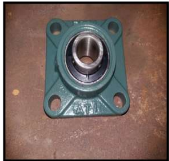
Fig. 3: Special Purpose Bearing (Ball Thrust Bearing).