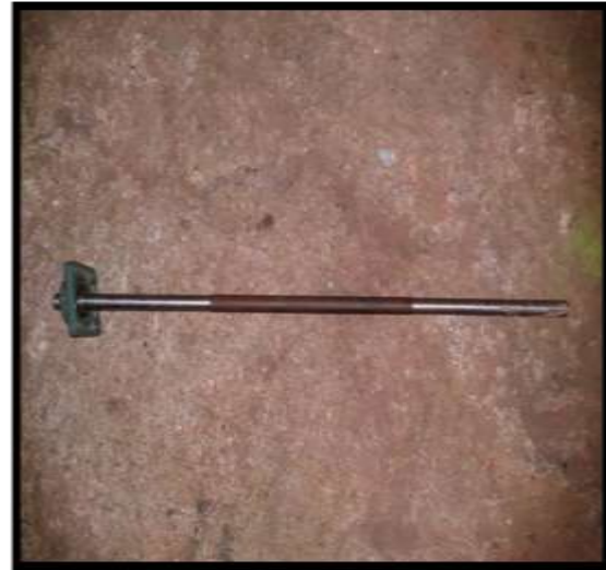
Fig. 2: Supporting Rod.