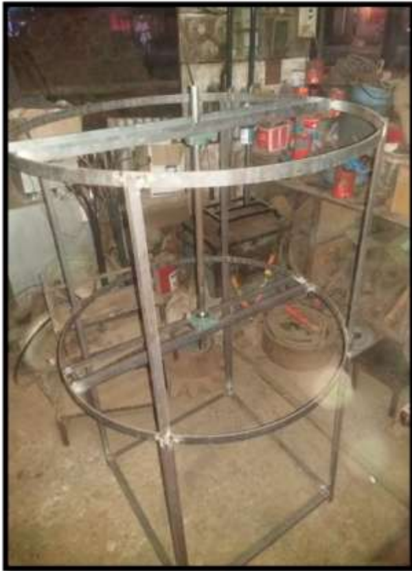
Fig. 4: Supporting Structure.