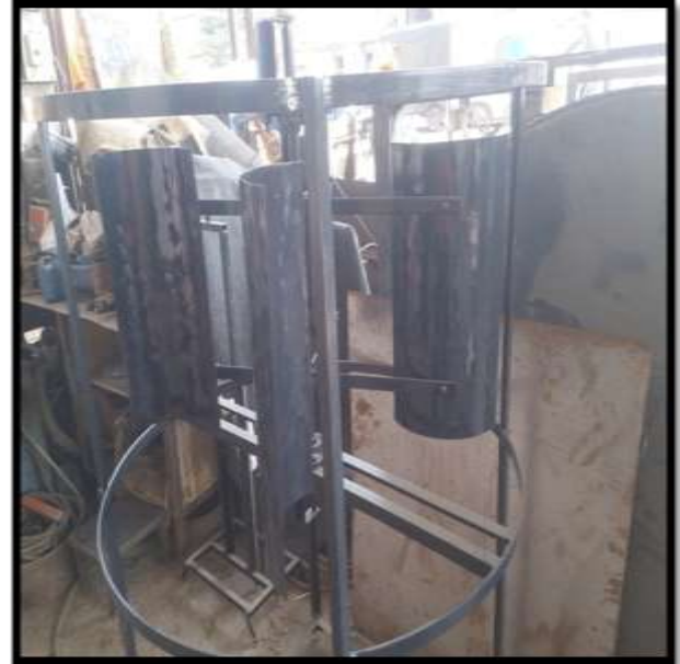
Fig. 5: Complete Assembly Model.