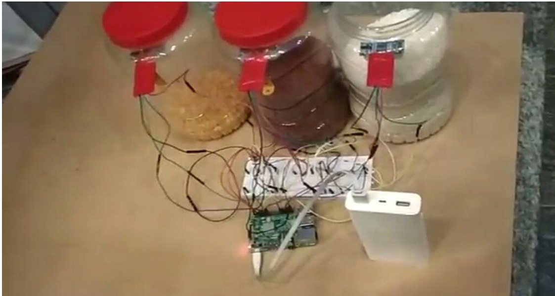
Figure 2: Raspberry pie.

Raspberry pie constantly processes the signals sent by the ultrasonic sensors and compares it with the threshold value. Whenever the calculated value is found lesser than the threshold value then it is automatically ordered online in any of the given e-commerce website and an email notification is sent to the mobile.