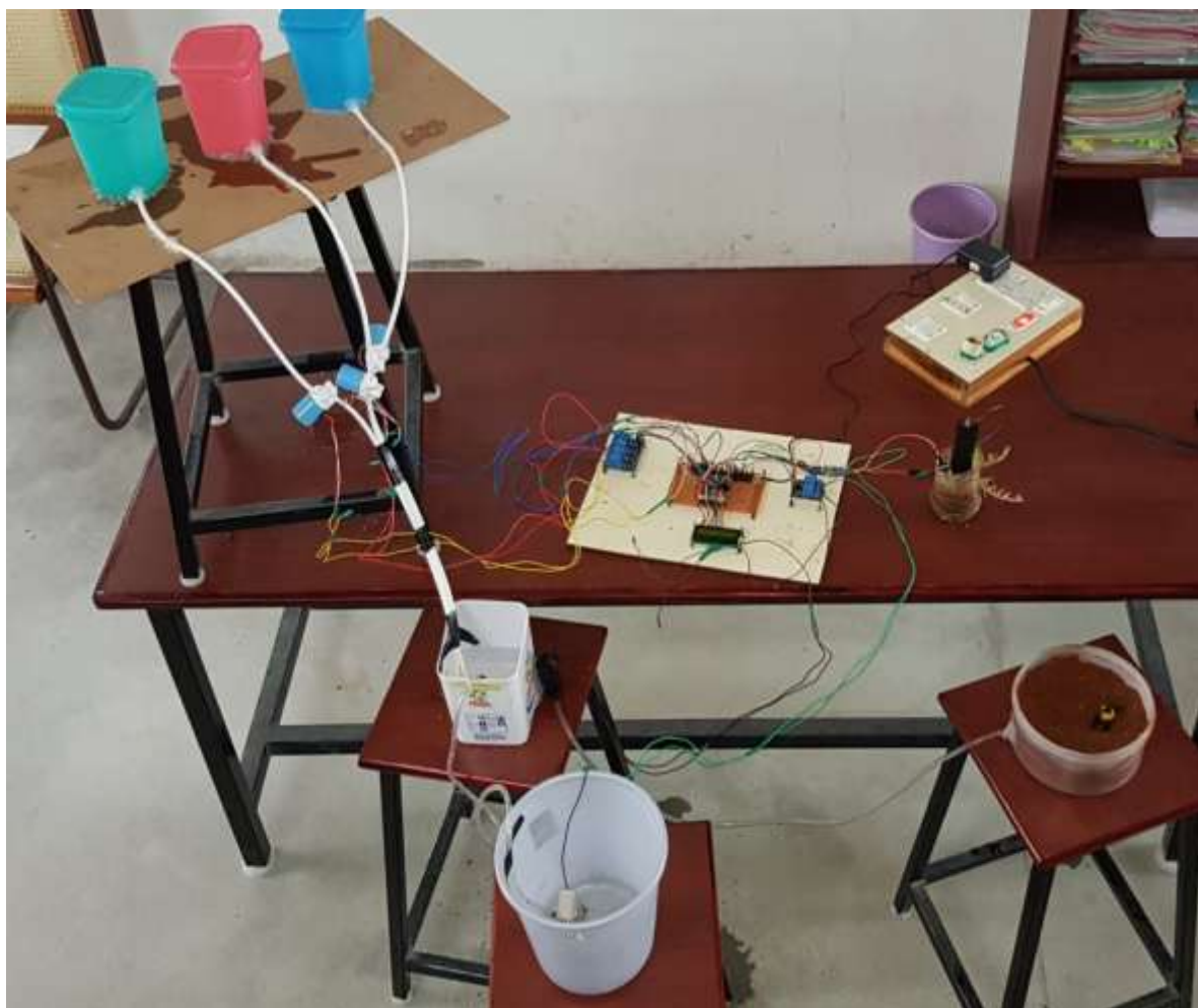
Figure 2: Hardware Setup

the organic compound present in the soil will be derived and also the preferred vegetation for the fertilizers are suggested using Arduino Nano. Fertilizer and water mixed in mixer tank is sprayed to land using sprinkler system. Water is supplied to the land based on the moisture level. Figure 2 shows the Hardware setup.