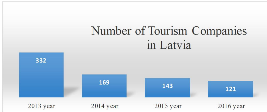
Fig.1 Number of tour operators in Latvia

Source: Central Statistical Bureau, 2017