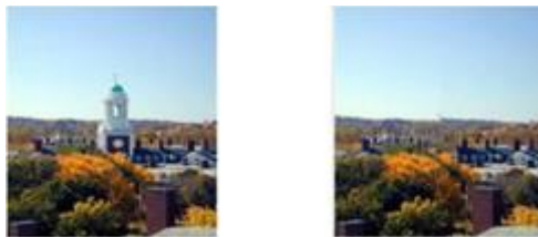
[a]Original photograph [b] In-painted photograph

The filling-in of missing region in an image is known as Image In-painting. In-painting is the art of modifying an image or video in a form that is not easily detectable by an ordinary observer. Image in-painting has become a functional area of research and development in image processing. The image is modified such that modification of image is non detectable for an observer ,who want to know the original mage in practice as same as old artistic .The process is to bring medieval picture, up to date as to fill gaps in between. This process is called as in-painting.