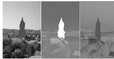
Fig.[ 3] Image characteristic (a)Texture composition (Y), (b) Color composition (Cb) (c) Color composition (Cr).

When we repair to the highest frequency layer in the wavelet domain, we will acquire the reconstruction image of the highest resolution. we can obviously find the color composition, Cb and Cr, has the highly neighbouring relativity. We have to use neighbour information of the valid pixel to restore the colour image. As per the concept.