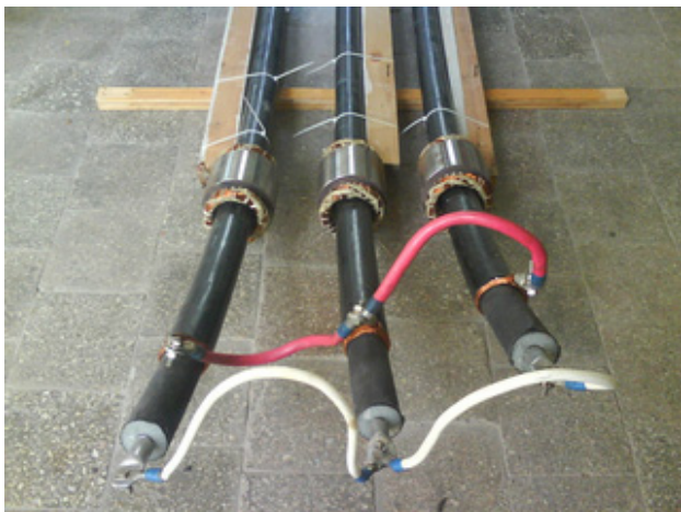
Fig. 2. Physical layout of the CL

To verify (9), we use the results of experimental studies performed by the authors of [8]. The research was carried out on the physical model of the CL. The model is made of NA2XSF(L)2Y-110 1×240/70 cables of length l=10 m (Fig. 2). The active resistance of the cable screen length unit is R^*=0.29 \times 10^{-3} \Omega/\text{m} . The distance between the axes of the cables is 0.2 m. The current value in the conductors of the cables is 95 A.