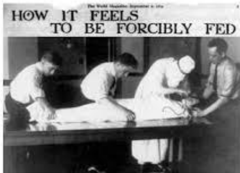
Figure 1.2: Djuna Barnes, "How it Feels to be Forcibly Fed," New York World Magazine , 6 September 1914

on hunger strike and eventually had to be released in order to recover their strength. To remedy this situation, thousands of striking suffragettes were forcibly fed by way of a feeding tube which was forced through the nose or mouth and into the esophagus. The practice was traumatic for those subjected to it not only because they were strapped down and force-fed against their will, but also because the procedure itself could be dangerous. The feeding liquid could enter the lungs and cause pneumonia and other respiratory ailments, leading to illness and in some cases death.