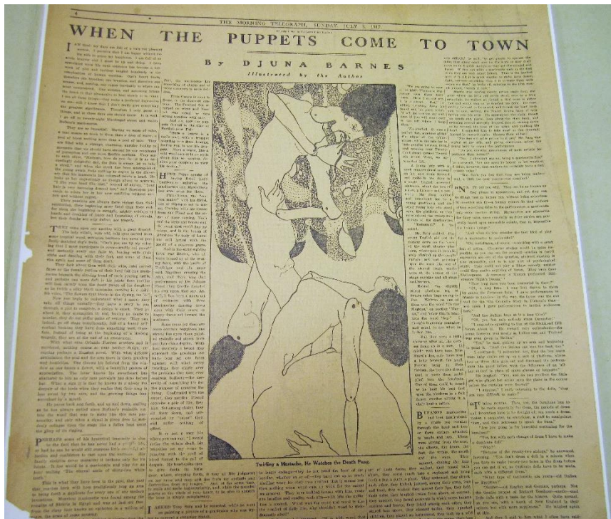
Figure 1.1: Djuna Barnes, "When the Puppets Come to Town," Djuna Barnes papers, Special Collections, University of Maryland Libraries

childish voice, ‘The flowers that bloom in the Spring, tra la’” (“Puppets”). As if this highly imaginative and detailed description isn’t enough, Barnes includes a large drawing that illustrates this scene. It features the figure of a woman with a tuft of dark hair and obvious bolts in her shoulders and elbows bending over backward from her impossibly narrow waist. A male figure positioned above her twirls a stringy moustache and looks down upon her with an expressionless face.