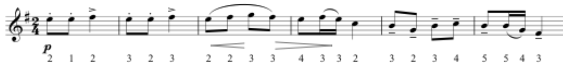
Figure 2. Note Grouping illustrated in “Sakura” from Madame Butterfly 44

Each note of the melody received a number used to indicate the relative intensity each note should be given. Tabuteau only used consecutive numbers because his intention was to create a sense of line. Numbers are repeated as a means of creating proportion. For example, in the last measure of this excerpt, five is repeated on the first sixteenth note so that the descent to the F-sharp sounds even, and the second B on the sixteenth note does not get swallowed by the surrounding pitches.