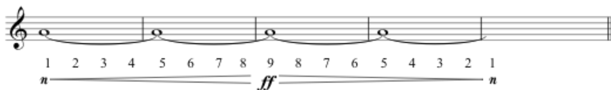
Figure 4. Long Tone Exercise

De Lancie advanced the idea that long tones are necessary for developing control of the instrument. He recognized that control of the tone could be attained by working from the soft end of the dynamic spectrum upwards. He found that inexperienced and unrefined players often strive to play loud, but the unfocused, spread tone that resulted was not the same as a full,