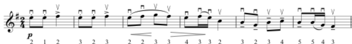
Figure 3. Distribution illustrated in “Sakura” from Madame Butterfly 46

In Lesson 3, Tabuteau cautions the performer to “remember the progression of numbers is not exactly a crescendo or a diminuendo. It is rather a scaling of color.” 47 He equates this notion with the bowing distribution on the violin. 48 The tone color over the fingerboard is mellower, but as the bow approaches the bridge, it becomes brighter. To achieve a similar result on the oboe, variety of color is achieved by the position of the reed on the lips. The same note produced on the tip of the reed changes gradually as one moves toward the binding. This technique requires a flexible embouchure.