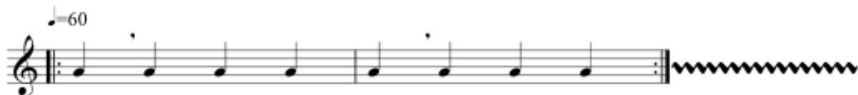
Figure 5. Articulated Long Tone Exercise

Grouping the notes in this manner corrects the habit of overly enunciating the downbeat. Each note has its own life and the music has forward motion. Additionally, de Lancie used this exercise to show that liveliness is determined by the clarity of the attack, not by the shortness of the note. 129