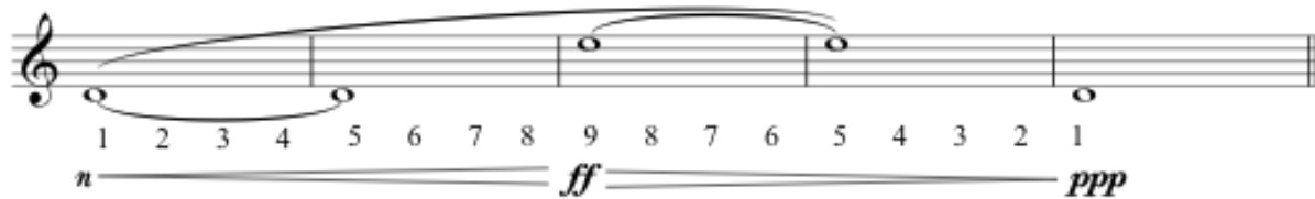
Figure 6. Long Tone Exercise with Intervals

It was de Lancie’s contention that practicing the fundamentals develops the correct embouchure, proper use of the air support and compels the oboist to construct stable, responsive reeds. Provided this criterion is in place, a natural vibrato will occur. In fact, when de Lancie asked Tabuteau how to produce vibrato, he replied, “Play long tones and it will happen.” 131 Schuring likes to approach the topic of vibrato in the same way with his students, although he uses an exercise to generate a sympathetic vibrato for the situations when it does not come as naturally. The metronome is set to a 60 pulse. A tone is sustained to begin, and then the player adds abdominal thrusts to each pulse. Each thrust is quick and firm. As the thrusts become consistent, two are added per pulse. The number increases until five. As the thrusts get quicker, they become smoother and less aggressive, and they are felt higher in the body somewhere near the base of the neck and top of the chest. This is the point where the pulsations become a sympathetic vibrato. This vibrato is natural and the oboist can learn to refine and control its