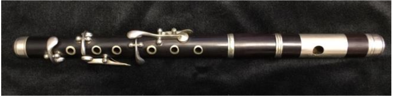
Figure 3. Anonymous English six-key, E-flat military piccolo, circa 1890.