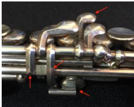
Figure 14. Keefe G# Trill Mechanism.

The G-sharp trill key facilitates the trill from G7 to A7, normally an awkward or impossible trill on most piccolos. The mechanism for this trill (see figure 14) includes the addition of a touch piece for the right hand that couples with the C-sharp trill key and allows the player to simultaneously vent the G-sharp and C-sharp trill tone holes with only one finger. 94