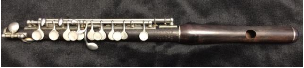
Figure 8. Boehm-system by Emil Rittershausen, Carl Fischer stencil piccolo, circa 1927.

The piccolo varied greatly in both design and materials during the early 1900s. The William S. Haynes Company reported that 95 percent of piccolos sold in 1930 were silver with a cylindrical bore. Silver was scarce during World War II and metal for military instruments was purchased from private sources. Both Haynes and Verne Q. Powell Flute, Inc. discontinued the production of wood piccolos for a limited time after World War II. 82 In 1950, both companies discontinued the production of cylindrical bore piccolos completely, continuing to make only conical bore wood and silver piccolos (see figure 10). During the same period, George Bundy