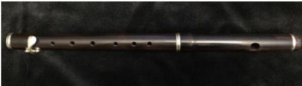
Figure 2. Anonymous one-keyed piccolo.

During the Baroque period (1600-1750), the piccolo began to separate from the fife likely due to the need for an instrument usable in concert settings. In this period, both the simple system flute and piccolo had cylindrical head joints with conical bore bodies, and a key to facilitate D-sharp (see figure 3)