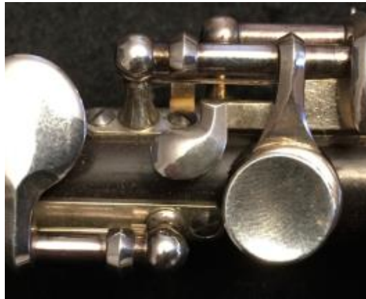
Figure 11. Keefe Brossa F sharp.

head joint styles as well as custom head joints. In addition, 14k gold options are available for the rings and sleeves on their head joints. Several innovative key work options are available including, Brossa F-sharp (see figure 11), the vented C key (see figure 12), split E mechanism, a G-sharp trill key, and a C-sharp trill key (see figure 13). The C-sharp trill key functions just as it does on the flute. The mechanism includes an additional tone hole and key between the trill and thumb B-flat tone holes as well as an additional lever near the chromatic B-flat lever. This mechanism has only recently become available likely due to the compact size of the piccolo and the inherent design problems that arise with additional key work in such a compact space.