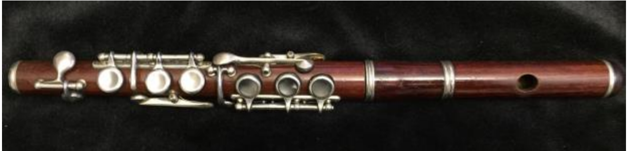
Figure 5. Anonymous English piccolo, circa 1870.

could be attributed to the inherent mechanical deficiencies of the simple-system piccolos which limited their ability to play in more remote key signatures called for as chromaticism grew. The Böehm mechanism was not immediately popular, and makers experimented with key work designs that attempted to keep the simple-system fingers while enlarging the tone holes for pitch and tone (see figure 6).