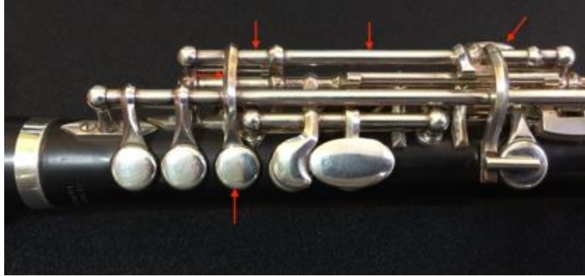
Figure 13. Keefe C sharp trill.

The G-sharp trill key facilitates the trill from G7 to A7, normally an awkward or impossible trill on most piccolos. The mechanism for this trill (see figure 14) includes the addition of a touch piece for the right hand that couples with the C-sharp trill key and allows the player to simultaneously vent the G-sharp and C-sharp trill tone holes with only one finger. 94