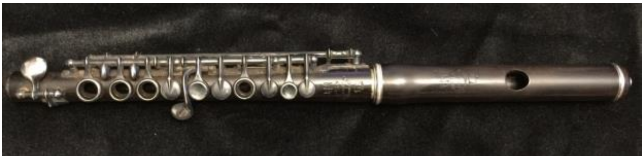
Figure 6. Thibouville Cabart ring-system piccolo, circa 1878.

The resurgence of orchestration including piccolo could be due in large part to the introduction and more widespread availability of the Böehm-system piccolo. Early Böehm-system piccolos used ring-keys keeping the open tone holes associated with the simple-system piccolos while also taking advantage of the newer mechanism (see figure 7).