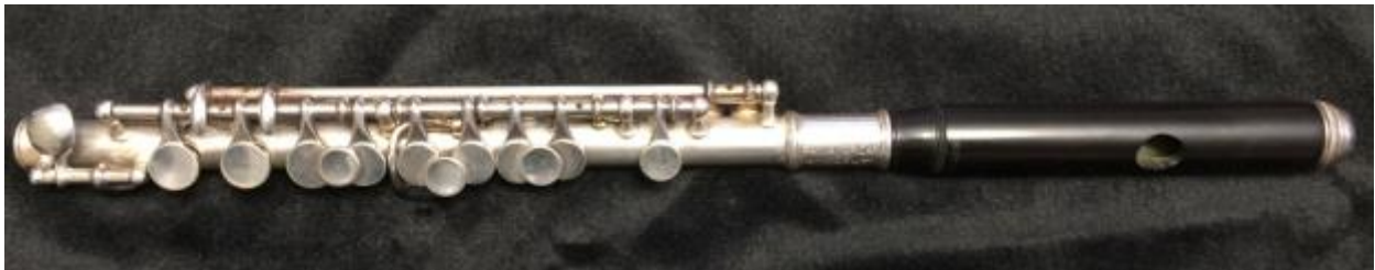
Figure 10. Conn Pan American model with ebonite head and silver body, circa 1925.

Some companies offer synthetic materials that emulate the tonal qualities of wood but are not affected by moisture or temperature extremes which can cause wood to crack. Ebonite is a hard, rubberized material that looks like dark wood, is easily machined, does not warp or crack, and produces a sweet wood-like tone. Ebonite was first introduced around 1840 and was predominantly used for piccolos due to frequent use outdoors. Ebonite is the name associated with musical instrument manufacturing although the material is more generally known as vulcanized rubber. Conn Instruments made piccolos with a cylindrical metal body and an ebonite head joint combining the new material into a production model (see figure 2)