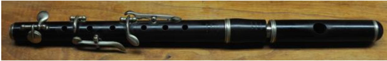
Figure 7. Jean-Louis Tulou, Paris. six-key D-flat Piccolo, Pitch A=435.

The piccolo received the greatest mechanical advancement at the beginning of the twentieth-century. Performers and composers were aware of the inconsistency of instruments in use and growing demand encouraged makers to focus on applying the Böehm-system. Instruments made of gold, silver, German silver, and many types of composite materials appeared in the market due to the growth in experimentation. The early twentieth century also saw a rise in the retail market and distribution of professional instruments. Large music retailers began marketing instruments under their company name although the instruments were made by well-known and respected makers not the retailer. Carl Fischer Music was one such retailer in New York and an importer of professional instruments. The company imported instruments from notable French and German makers and added the Carl Fischer logo, referred to as a stencil, before selling the instrument. Respected flute and piccolo maker, Emil Rittershausen (1852-1927), was a German maker who was trained by Böehm in the shops of Böehm & Mendler. 81 Rittershausen exported to Carl Fischer who added the Fischer stencil (see figure 9).