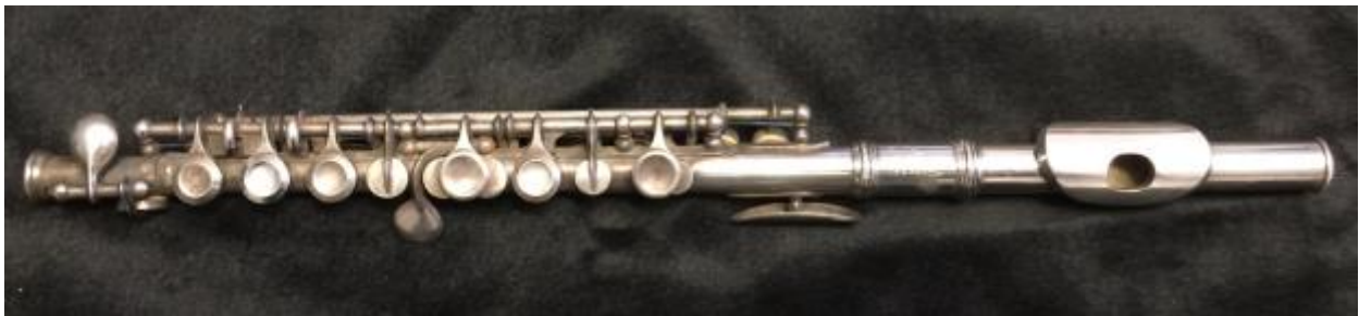
Figure 9. Carl Fischer silver conical D-flat piccolo, circa 1925.

The piccolo varied greatly in both design and materials during the early 1900s. The William S. Haynes Company reported that 95 percent of piccolos sold in 1930 were silver with a cylindrical bore. Silver was scarce during World War II and metal for military instruments was purchased from private sources. Both Haynes and Verne Q. Powell Flute, Inc. discontinued the production of wood piccolos for a limited time after World War II. 82 In 1950, both companies discontinued the production of cylindrical bore piccolos completely, continuing to make only conical bore wood and silver piccolos (see figure 10). During the same period, George Bundy