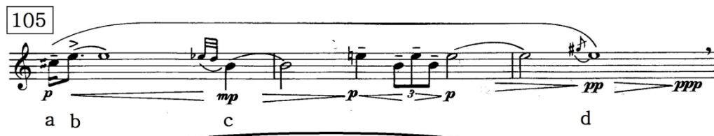
Example 12: Main tone technique in measures 105 to 107

This gesture can be likened to a bowed gesture, which is typically found in the music of Isang Yun as well as traditional Korean music.