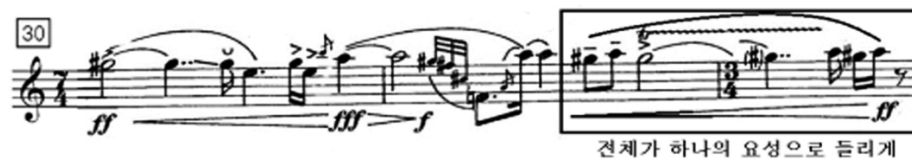
Example 32: Measures 30 to 32 of Sori 92

Another traditional Korean technique that makes an appearance in Yun's Sori is known as Chuseong . Chuseong means “push up the end of the sound” or “lift up the end of the sound.” This is the effect triggered by moving from bass to treble, when the bass is accented or emphasized to create a forward energy that results in the treble's growth; it is somewhat similar to the Western “ appoggiatura .” The initial pitch sounds on a lower sonority which is then followed by the next pitch which is typically a 2 nd or 3 rd up from the bass. In addition to this change in tessitura, the performer is expected to “push the sound up” by increasing the intensity of the air stream or even accenting the arrival tone. 93