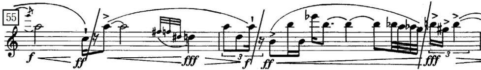
Example 29: Measure 55

Measure 55 shows the sudden finish after the decorative tone, as occurs during “Cheong Jeong Chaginhapip” in Example 28. In this instance, it is necessary to breathe and produce the sound aggressively and abruptly in order to interrupt the air stream and stop the sound.