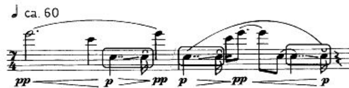
Example 10: Glissandi in measures 16 and 17

With an open hole instrument, the open hole can be used to create a pitch bending effect. The fingers may be pulled slowly backward or to the side of the desired key in order to uncover the key hole, leaving the finger depressing the rim of the key only and producing a pitch between two genuine notes. For example, a player may achieve a pitch near G# (though not quite truly G#) by moving the finger slowly outward. Other special symbols, \frac{1}{4} pitch and \sim pitch, are used to represent glissandi by microtones, originally limited to strings, but now also used in wind