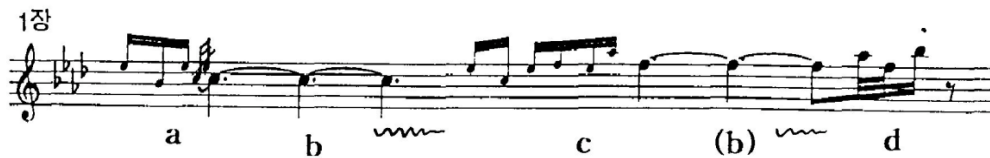
Example 13: Main tone technique of “Cheong Jeong Chaginhani.”

Unlike Sections 1 and 2, the texture of Section 3 lacks ornaments and pitch bends, tending to move directly from one main tone to the next. Additionally, the main tones themselves throughout this section are overall longer in duration. The contrasts throughout this work can be compared to the elements of Yin and Yang, which differ from the oppositional dichotomous aspects of dialectic thought (i.e., the thesis-antithesis-synthesis known from Western philosophy). In short, the contrast between phrases utilizing the main tone technique and those not utilizing it are not in contradiction with each other, but are different aspects of the same.