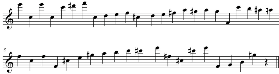
Example 11: A reduction of the main tones in Section 2

In this section, Yun's music is single-minded: he clings to the goal like an arrow to a target, pushing his power forward.