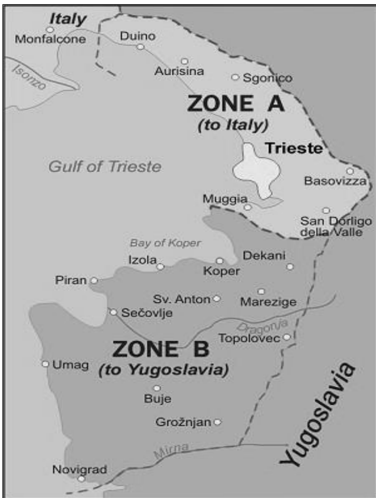
Map VII: the State Frontier between Italy and Yugoslavia after Osimo