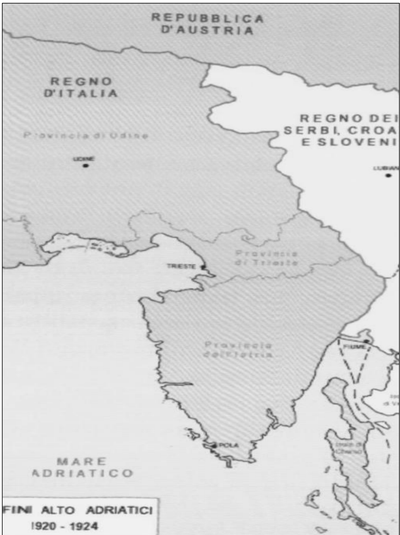
Map II: Italy's Eastern Border after the 1921 Rapallo Treaty