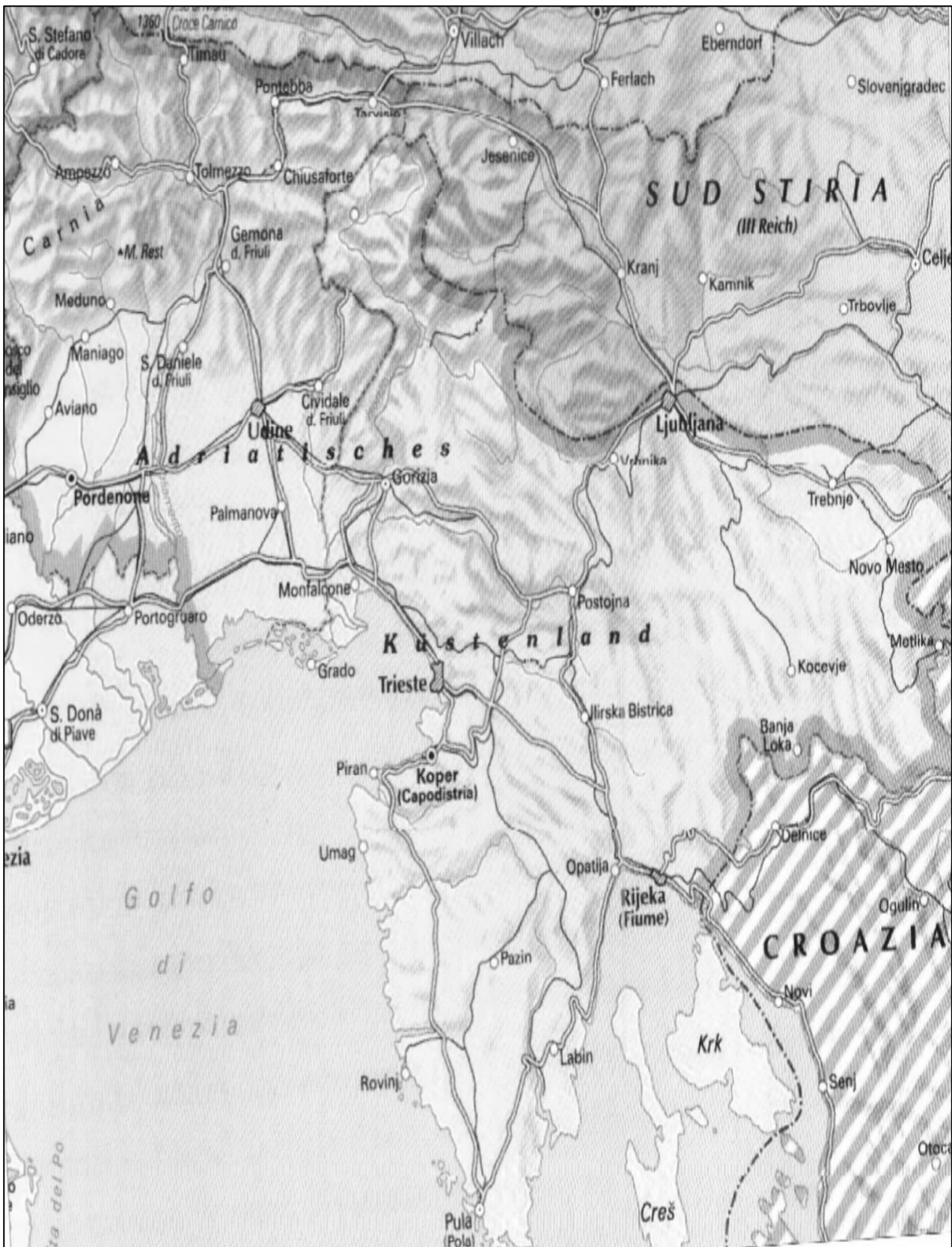
Map III: the Operational Zone of the Adriatic Littoral