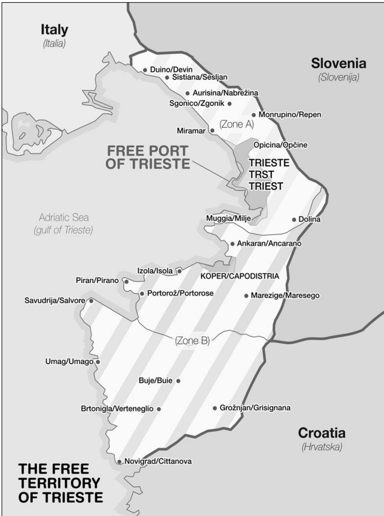
Map V: the Free Territory of Trieste