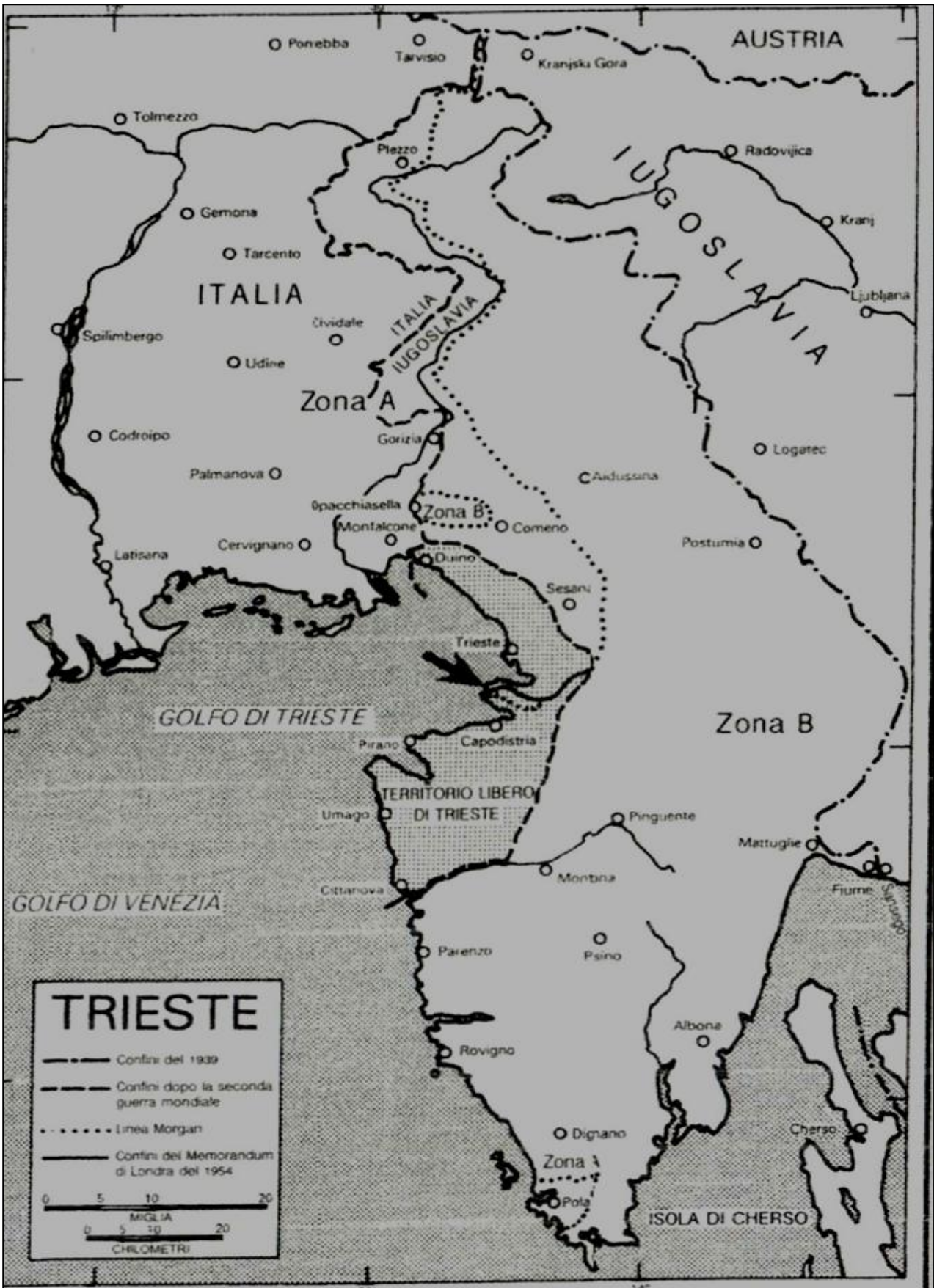
Map VI: Italy's Eastern Border after the 1954 London Memorandum