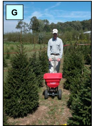
Fig. 1. Images of a tractor-mounted (A and B) Herd spreader or (C and D) Vicon spreader; an on / off switch for the Herd spreader mounted on the (E) fender of a tractor or (F) beneath the tractor seat; and (G) an Earth-Way push spreader being used to apply fire ant bait in a commercial nursery.