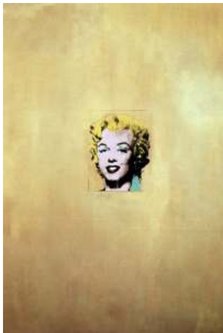
Figure 12: Gold Marilyn Monroe , 1962 Andy Warhol Acrylic, oil, and silkscreen on canvas, 83 1/4 x 57 in The Museum of Modern Art, New York