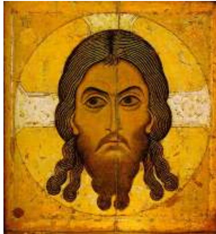
Figure 2: Icon of The Holy Face (Acheiropietos) Moscow School, 12 th Century