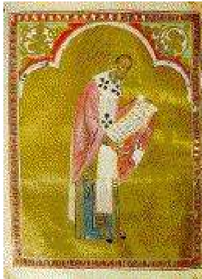
Figure 26: Icon of St. Andrew