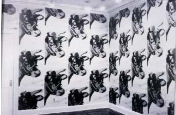
Figure 9: Cow Wallpaper (installation), 1966 Andy Warhol Leo Castelli Gallery, New York