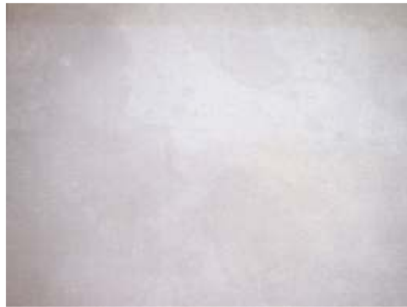
Figure 32: The Stations of the Cross: Lema Sabachthani, Fourteenth Station , 1966 Barnett Newman Magna on canvas, fifteen panels, each 78 x 60.5 in National Gallery of Art, Washington DC