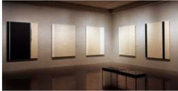
Figure 31: The Stations of the Cross: Lema Sabachthani (installation), 1966 Barnett Newman Magna on canvas, fifteen panels, each 78 x 60.5 in National Gallery of Art, Washington DC