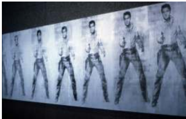
Figure 24: Elvis 11 Times , 1963 Andy Warhol Silkscreen ink and silver paint on linen, 82 x 438 in Andy Warhol Museum, Pittsburgh