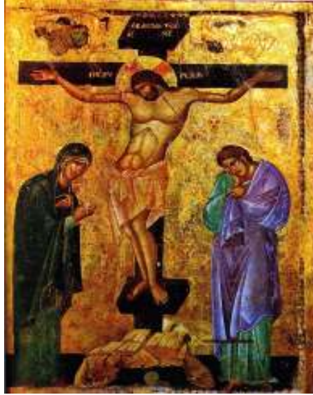
Figure 19: Icon of The Crucifixion