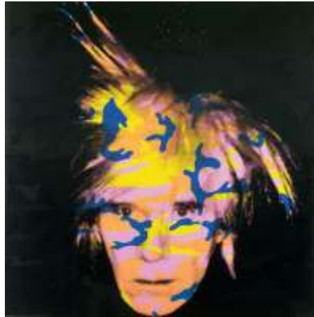
Figure 10: Self-Portrait , 1986 Andy Warhol Acrylic and silkscreen ink on linen, 203.5 x 203.5 cm The Andy Warhol Museum, Pittsburgh