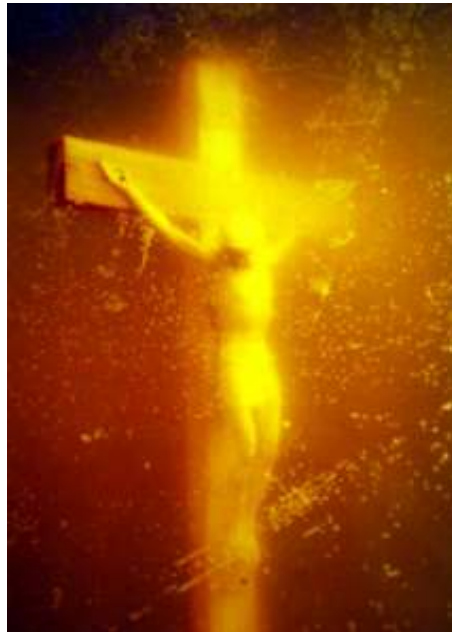
Figure 28: Piss Christ , 1987 Andres Serrano Photograph