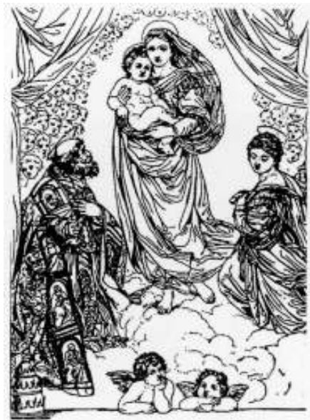
Figure 36: Encyclopedia Illustration of Raphael's Sistine Madonna , 19 th Century: