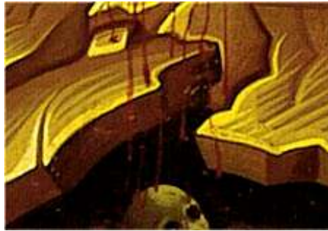
Figure 20: Icon of The Crucifixion (detail)