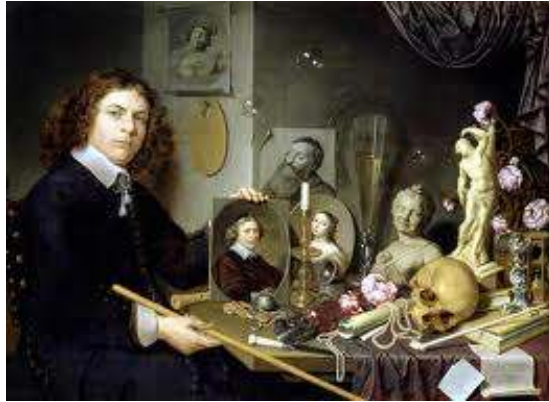
Figure 17: Vanitas Still-life with a Portrait of a Young Painter , 1651 David Bailly Oil on panel, 93 x 124 cm Stedelijk Museum De Lakenhal, Leiden