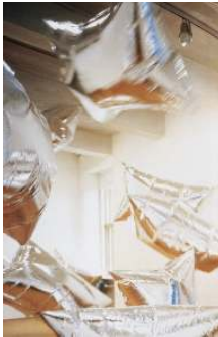
Figure 14: Silver Clouds (installation), 1966 Andy Warhol Helium-filled metalized plastic Andy Warhol Museum, Pittsburgh