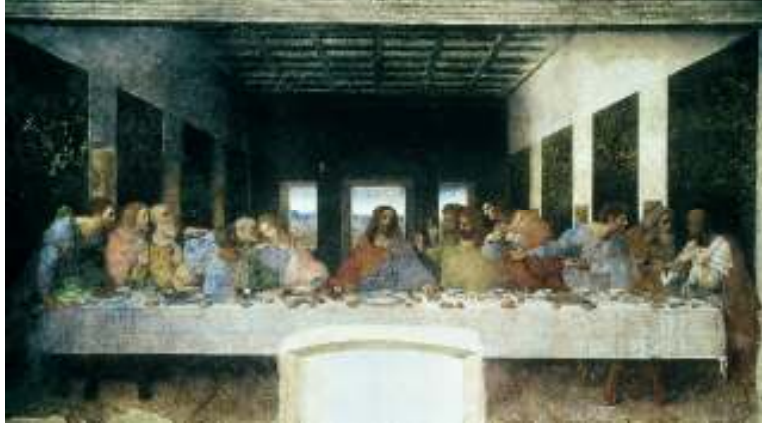
Figure 1: Last Supper , 1495-97/98 Leonardo da Vinci Painting, 460 cm x 880 cm Refectory of the Convent of Santa Maria delle Grazie, Milan