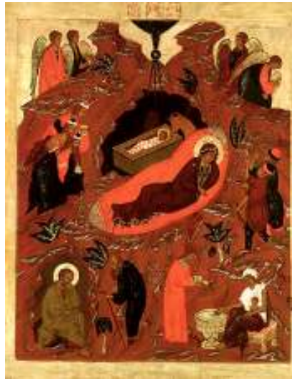
Figure 38: Icon of The Nativity of Christ