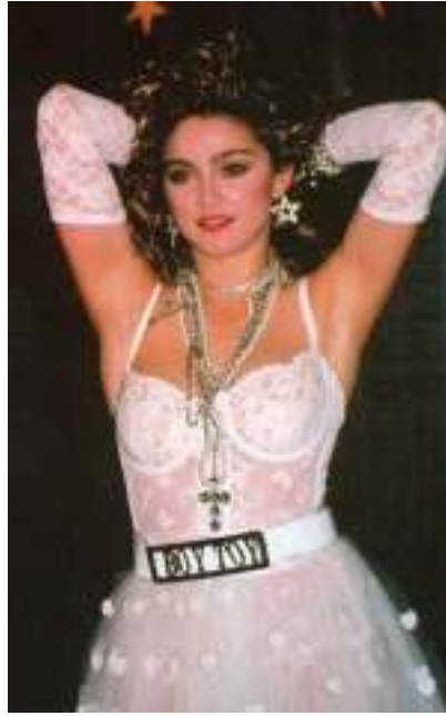
Figure 39: Photograph of Madonna, 1984