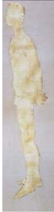
Figure 25: Golden Boy , 1957 Andy Warhol Ink and gold leaf on paper, 97 x 35 5/8 in Collection of Erich Marx, Berlin