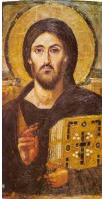
Figure 3: Icon of Christ Pantocrator Byzantine 6 th Century St. Catharine's, Sinai