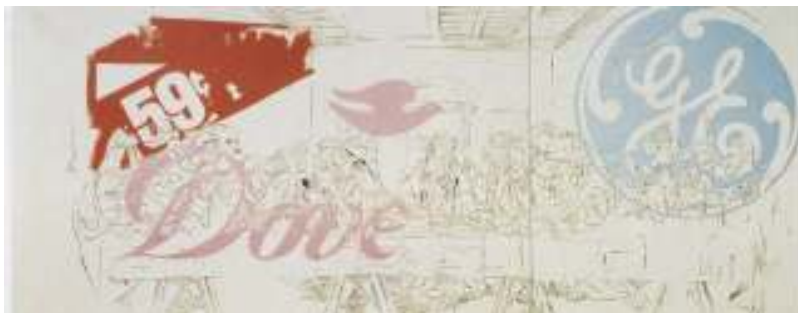
Figure 42: The Last Supper (Dove) , 1986 Andy Warhol Synthetic polymer paint and silkscreen on canvas, 119 x 263 in The Museum of Modern Art, New York