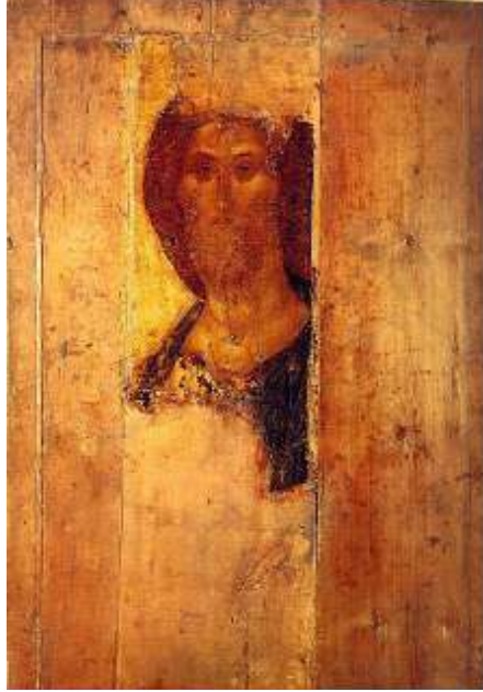
Figure 13: Icon of Christ the Redeemer Andrei Rublev Tretyakov Gallery, Moscow