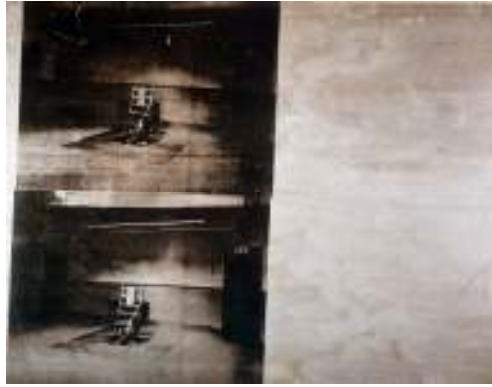
Figure 33: Double Silver Disaster , 1963 Andy Warhol Acrylic and liquitex silkscreen on canvas, 106.5 x 132 cm J.W. Fröhlich Collection, Stuttgart