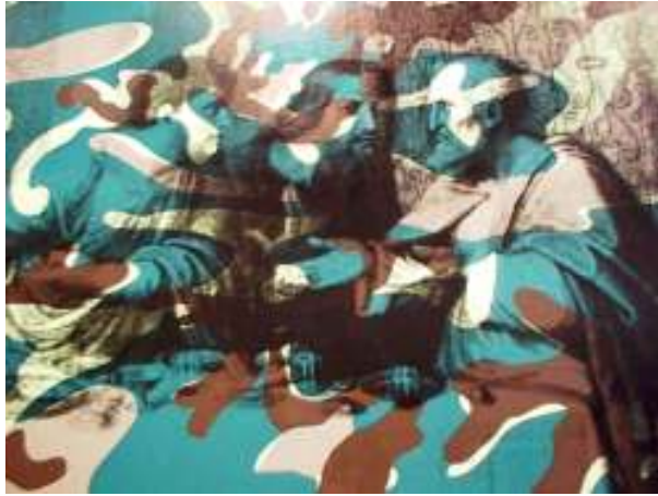
Figure 41: The Camouflage Last Supper (detail), 1986 Andy Warhol Synthetic polymer paint and silkscreen on canvas, 78 x 306 in The Menil Collection, Houston