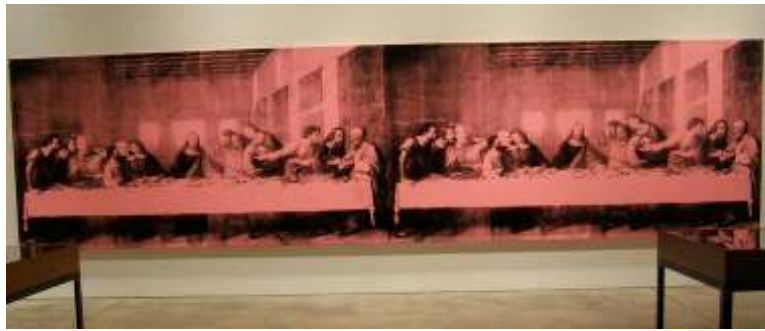
Figure 40: The Last Supper (Pink) (installation), 1986 Andy Warhol Synthetic polymer paint and silkscreen on canvas, 78 x 306 in The Andy Warhol Museum, Pittsburgh