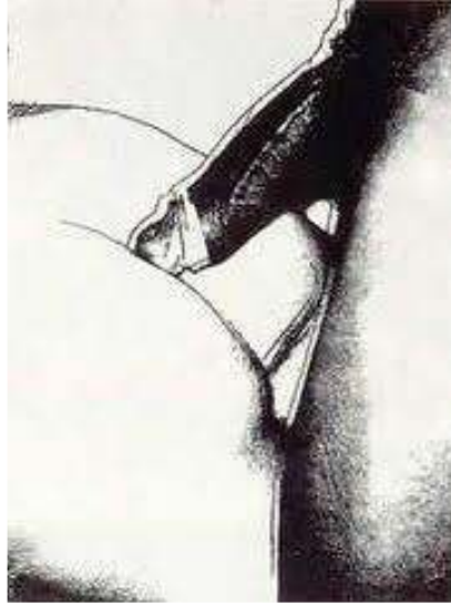
Figure 27: Sex-Parts , 1978 Andy Warhol Screenprint on HMP paper 31 x 23.25 in Andy Warhol Enterprises, Inc., New York