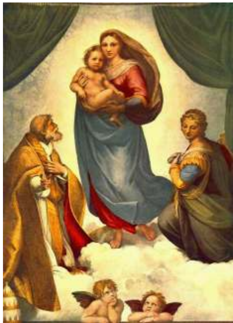
Figure 34: Sistine Madonna , 1513/14 Raphael Oil on Canvas, 8 ft 8 1/2 x 6 ft 5 in The Old Masters Picture Gallery, Dresden, Germany