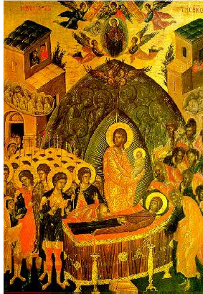
Figure 37: Icon of The Dormition of the Virgin , 15 th Century Andrea Ritzos Galleria Sabauda, Turin