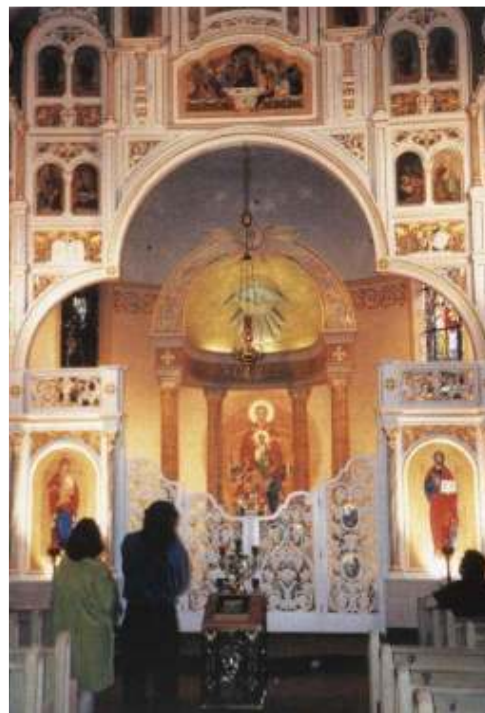
Figure 6: Original Iconostasis in St. John Chrysostom Byzantine Catholic Church, Pittsburgh