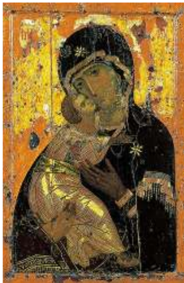
Figure 4: Icon of Virgin of Vladimir Painted wood, 30 1/2 x 21 in Byzantine, 12 th Century Tretiakov National Art Gallery, Moscow