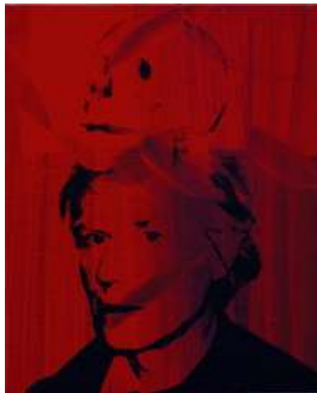
Figure 18: Self-Portrait with Skull , 1978 Andy Warhol Acrylic and silkscreen ink on canvas, 40.6 x 33 cm Tate and National Galleries of Scotland