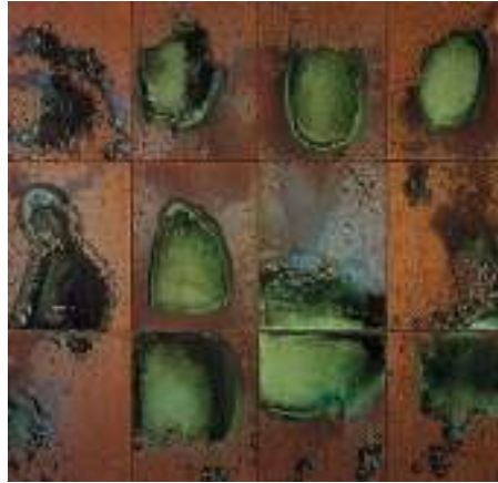
Figure 23: Oxidation Painting (in 12 parts) , 1978 Andy Warhol Acrylic and urine on linen, 121.9 x 124.5 cm The Andy Warhol Museum, Pittsburgh