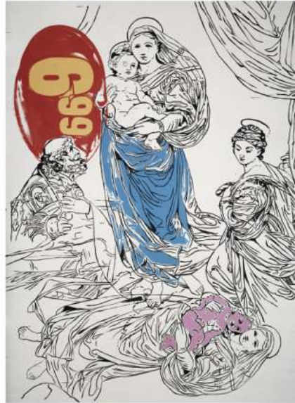
Figure 35: Raphael I – 6.99, 1985 Andy Warhol Acrylic on canvas, 13 ft ¼ in x 9 ft 8 in The Estate of Andy Warhol