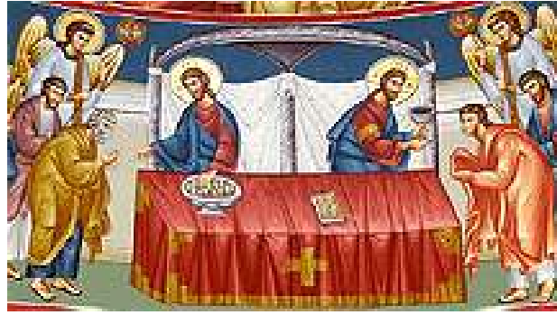
Figure 5: Icon of The Communion of the Apostles