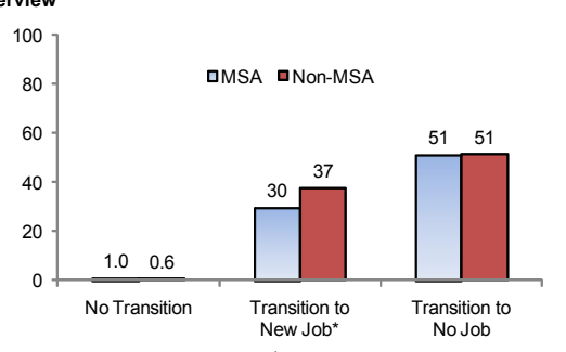
Figure 1. Percent Uninsured after an Employment Transition: All Adult Workers Age 18 – 64 with Employer Coverage at First

* Difference between MSA / non-MSA significant at p< .05