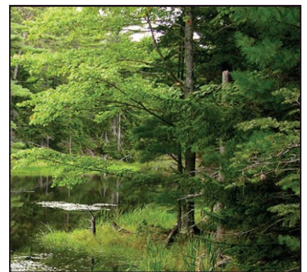
Otter Brook Preserve, Harpswell