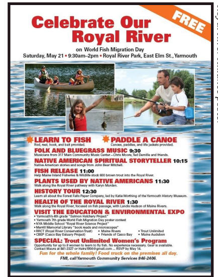
Royal River Alliance poster

Look for more Casco Bay Stories in the future!