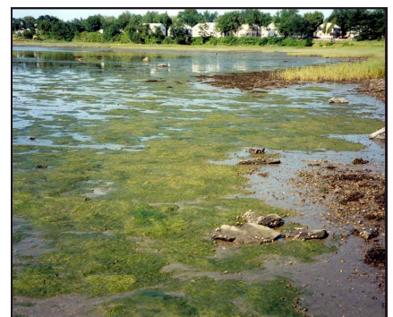
Green Algae Mat