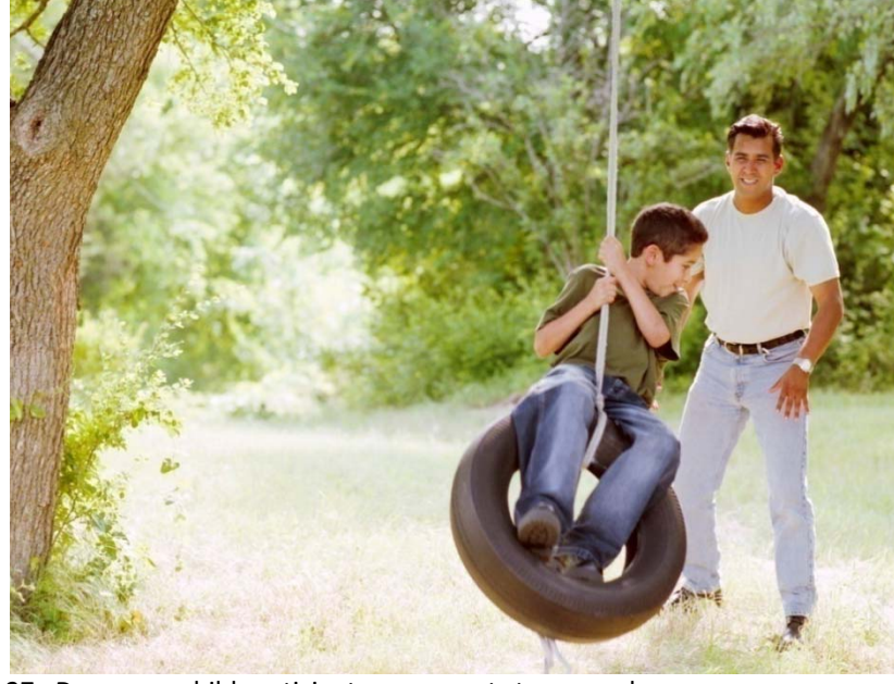
27. Does your child participate on a sports team, such as soccer, basketball, or softball?

16. When grocery shopping, do you read nutrition labels? Never Sometimes Often Rarely Always 17. Do you plan meals ahead of time? Never Rarely Sometimes Often Always 18. Does your child help shop for food? Never Rarely Sometimes Often Always 19. Does your child help fix meals? Never Rarely Sometimes Often Always 20. Do you set limits on how many hours your child can watch TV, play video games, or talk on the phone? Never Rarely Sometimes Often Always 21. Does your family do physical activities together? Never Rarely Sometimes Often Always 22. Does your child have access to sports or exercise equipment in your home such as balls, bikes, and jump ropes? Rarely Sometimes Often Always Never 23. Are you physically active for at least 30 minutes or more on all or most days of the week? Often Never Rarely Sometimes Always 24. Is your child physically active for a total of 60 minutes or more on all or most days of the week? Never Rarely Sometimes Often Always 25. Does your child walk to school? Often Never Rarely Sometimes Always 26. Does your child participate in "everyday physical activities," such as indoor/outdoor chores, gardening, yard work, playing with pets, etc.? Often Never Rarely Sometimes Always