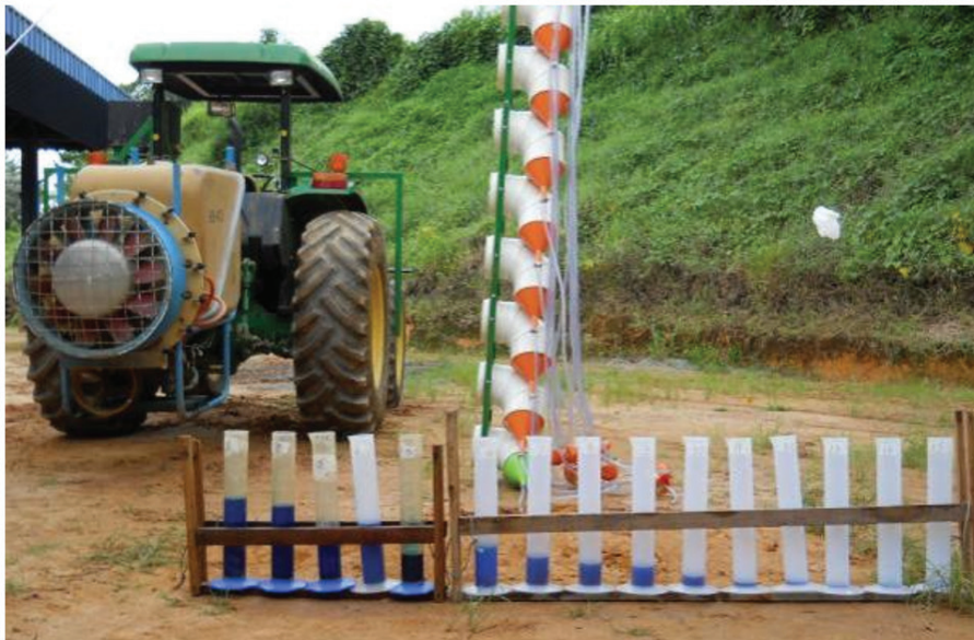
Figure 3. Device used to measure the uniformity of the vertical volumetric distribution.