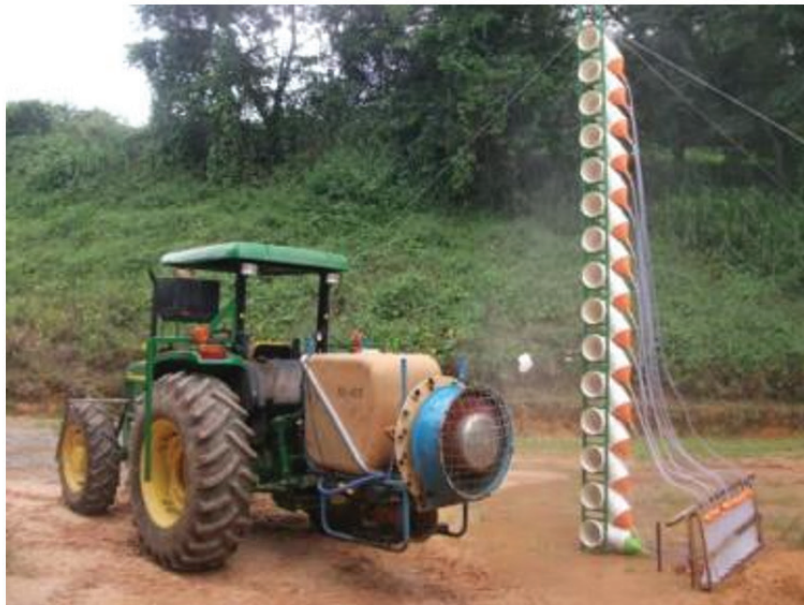
Figure 1. Vertical collector used for the determination of uniformity in the volumetric distribution.

The uniformity of liquid distribution in the vertical was analyzed using a vertical collector, built with polyvinyl chloride elbows (PVC), of 200 millimeters of diameter, half inch hoses, beakers, funnels and two bars of Metalon (20 x 30 millimeters) of 4.5 meters of height (Figure 1). The collector was positioned was placed two meters from the center