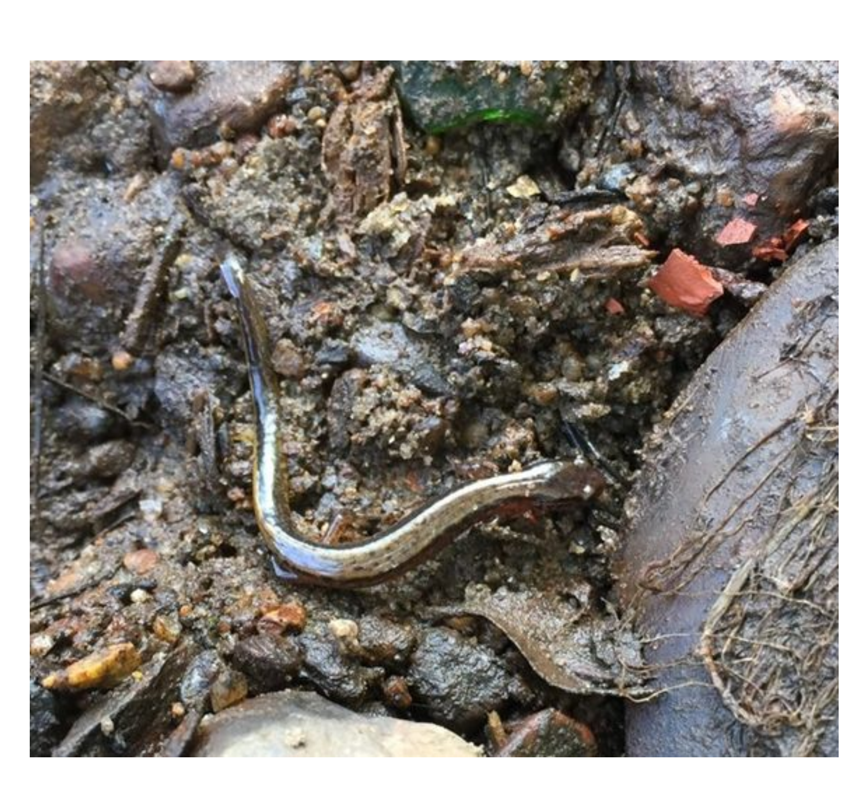
Figure 4. Northern two-lined salamander ( Eurycea bislineata ) logged during BioBlitz.