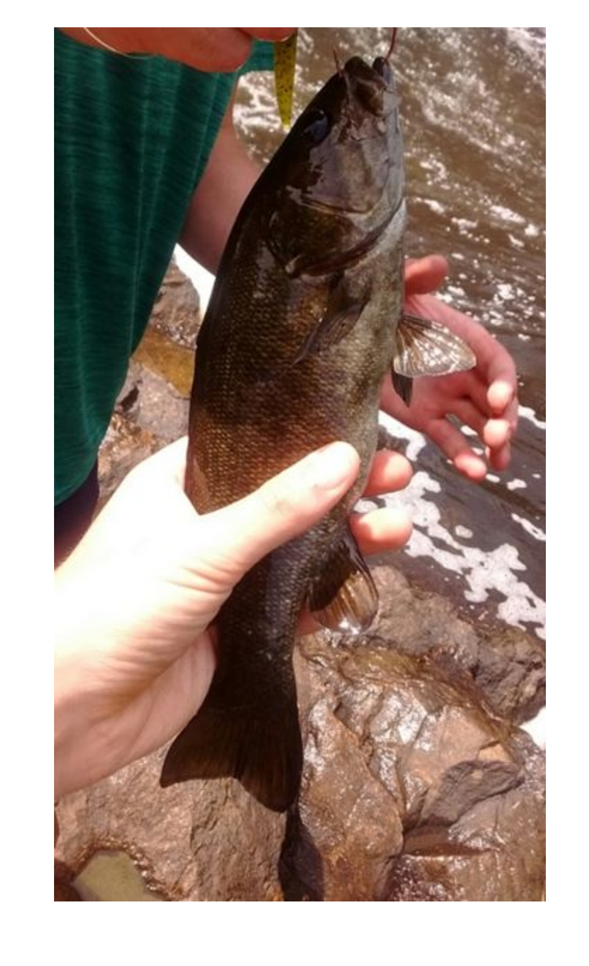
Figure 5. Smallmouth bass ( Micropterus dolomieu ) logged during BioBlitz.