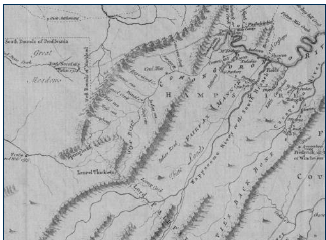
Fry-Jefferson "Map of the Inhabited Parts of Virginia," 1775 edition.