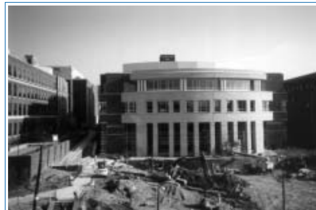
Crews apply the finishing touches to the face of the library.

funds to furnish the new and renovated facilities. Donors to the WVU Library Special Initiative will have their name linked to the furniture their gifts enable the library to purchase. Naming opportunities range from $150 for reader chairs to $5,000 for study carrels and information kiosks.