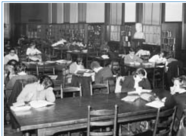
In the past, students would gather in a reading room in Wise Library to study material placed on reserve by their instructors.

Colson Reserve Library serves as a depository for homework problems, past exams and required and supplemental readings provided by faculty. The Libraries have worked with faculty on this service to students since the opening of the University Library in the early 1930's.