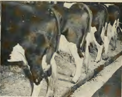
FIGURE 8. Cows in Modified Comfort Stalls at the end of a one-week cleanliness trial.