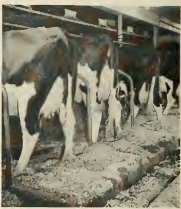
Cows in comfort stall at the end of a seven-day cleanliness trial.