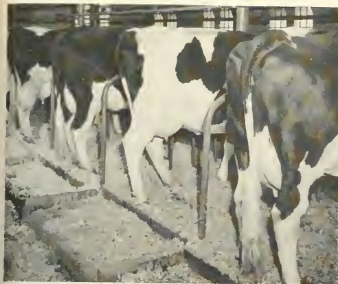
FIGURE 5. Cows in Comfort Stalls at beginning of one-week cleanliness trial.