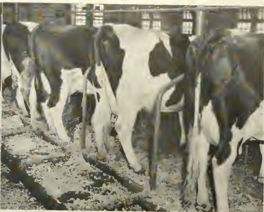
FIGURE 6. Cows in Comfort Stalls at the end of a one-week cleanliness trial.