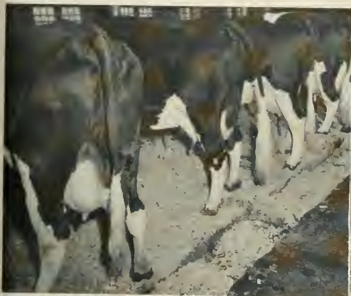
FIGURE 7. Cows in Modified Comfort Stalls at beginning of one-week cleanliness trial.