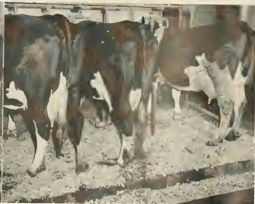
FIGURE 10. Cows in Stanchion Stalls at the end of a one-week cleanliness trial.