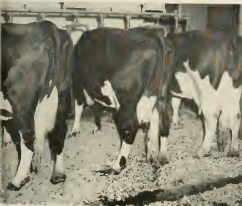
FIGURE 9. Cows in Stanchion Stalls at beginning of one-week cleanliness trial.