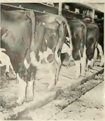
Cows in tie-chain stall at the end of a seven-day cleanliness trial.