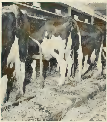
Cows in comfort stall at the beginning of a seven-day cleanliness trial.